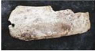
Plate with mammoth engraving inv. 370/731