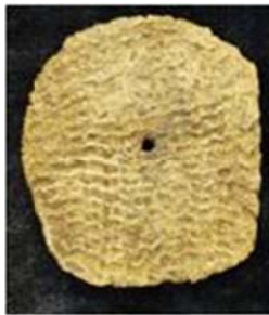
Plate with carved ornament, deep undulating lines, perforated in centre inv. 370/733

Publication: Abramova, Z.A. 1995 'L'art paléolithique d'Europe orientale et de Sibérie,' Grenoble, Cat.89,50; p.261