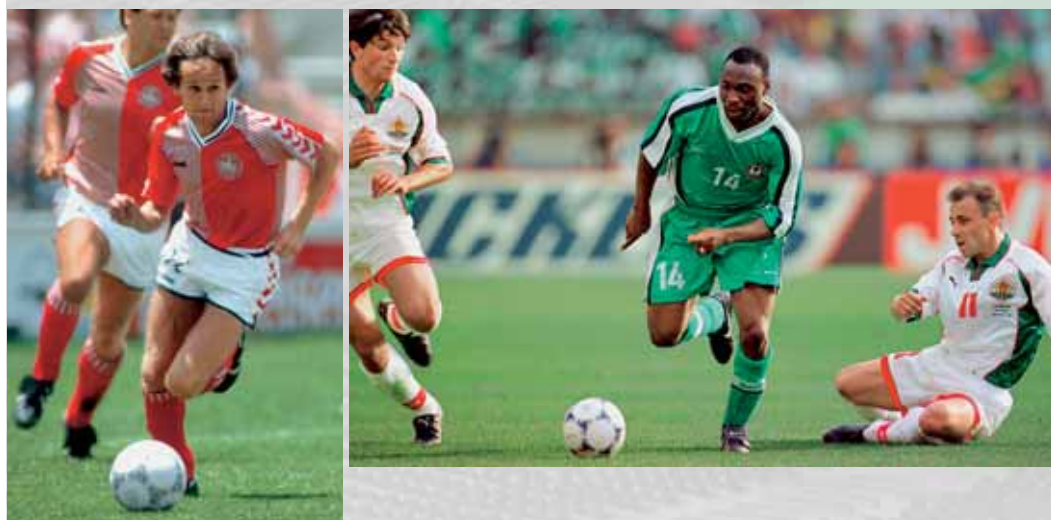
Two brilliant strikers: Allan Simonsen (left) and Daniel Amokachi.