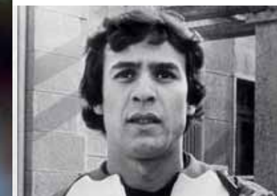
Josef Venglos, Marius Lacatus and Rabah Madjer.