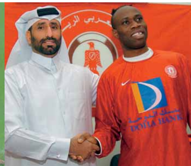
Famous for his football artistry and unconventional hairstyles: Taribo West with Ronaldo at Inter Milan, playing for Kaiserslautern and arriving in Qatar.