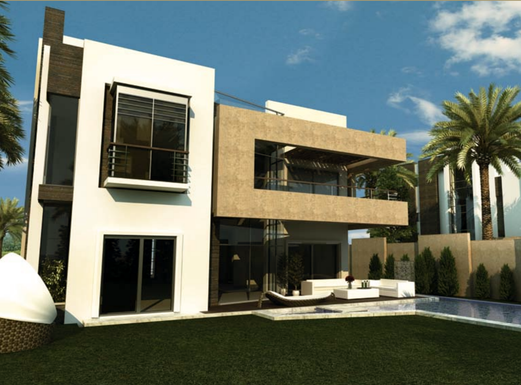
Villa Type | C