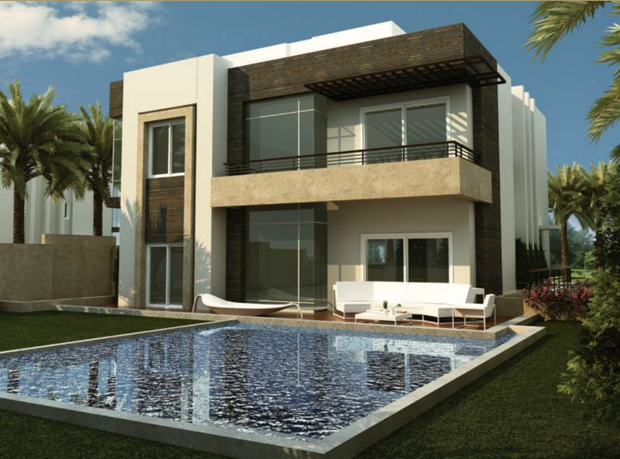
Villa Type | A