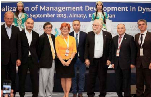
Conference business panel included a number of international businessmen who shared their views on local vs. global business challenges