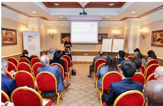
CEEMAN IQA Accreditation session