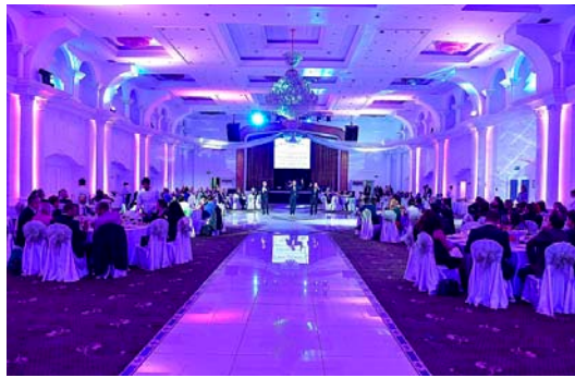
The conference concluded with a Gala dinner at Bakhchisaray Palace