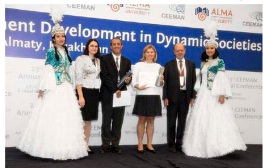
2015 CEEMAN Champions

In the winter edition of CEEMAN News you will have the opportunity to find out more about the CEEMAN Champion winners when we conduct an interview with them.