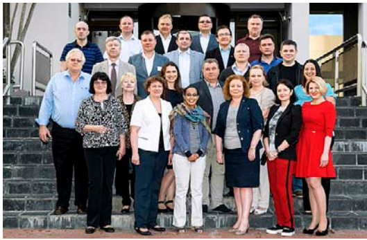
MIM-Kyiv SE MBA class at the University of Stellenbosch Business School

The international module for the MBA students was traditionally held at the Tepper School of Business at Carnegie Mellon University in Pittsburg, USA. A global leader of business education, it has hosted MIM's MBA international modules for more than 15 years. This year's program focused on strategy. The key courses were Strategic Leadership and Strategic Thinking, followed by Decision Making and Leadership Communications, Culture, and Change Management. The curriculum was complemented by lectures on the biotech and IT businesses. The module also featured Global Management Game stages.