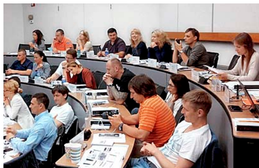
MIM-Kyiv MBA students at the Tepper School of Business

During the company visits, MIM's students got acquainted with different industries. A visit to Blacksberg Wine Estate featured a discussion of the operational model of the company, its sustainable growth, and corporate social responsibility. At the Capitec, locally controlled and licensed by the Reserve Bank of South Africa, MIM's commercial bank class discussed Capitec's banking strategy in an environment where people do not have bank accounts but widely use mobile money. For the students from Donbasenergo, a visit to the Malta power station was organized where they discussed management, safety, culture, and related markets trends. Fruits producer and exporter Two-A-Day&Tru-Cape and Massmart, a retailer, presented various South African industries to MIM's students.