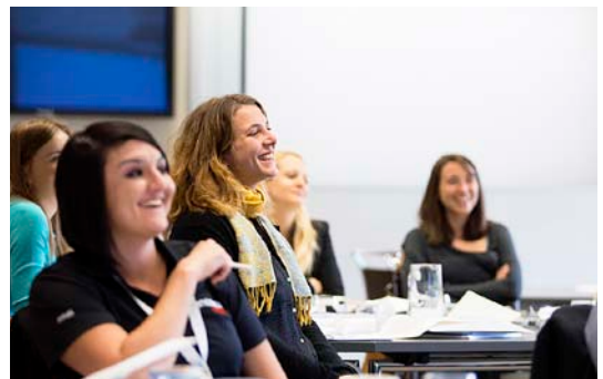
Program Management Seminar 2016 will be held from 13-15 April in Bled, Slovenia

This intensive and highly interactive three-day seminar was created to make Program Managers more effective in handling their increasingly demanding and complex responsibilities, and help develop capabilities related to the design, promotion and delivery of educational programs. It welcomes program managers, coordinators, and directors in charge of the overall program management and/or its individual segments, as well as institutional leaders (deans, directors, heads of departments) interested in improving the program management function at their institutions.