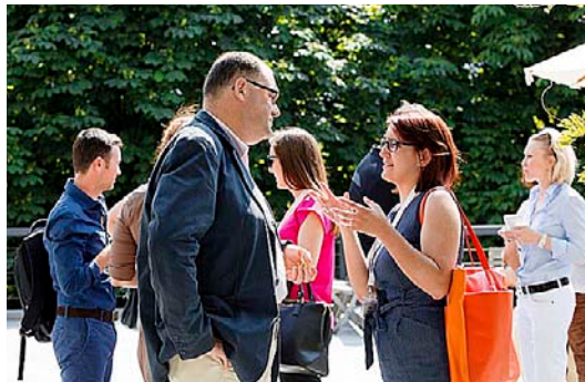
IMTA 2016 will take place from 12-23 June in Bled, Slovenia

Week 1: encompasses common issues and interests related to general aspects of management education, including teaching philosophy and strategy, teaching and learning methods (particularly the case method), teaching and learning tools, course design, and students' assessment and innovations in management education, including those based on technology. It also provides insight into the kinds of management educators that business schools are seeking so as to achieve and sustain relevance and excellence in business education and management development.