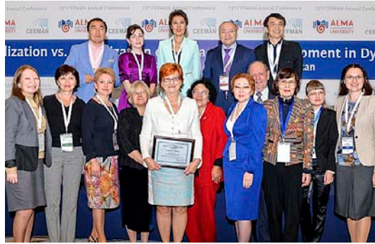
IMTA Alumni Club Kazakhstan established at the 23rd CEEMAN Annual Conference in Almaty, Kazakhstan

On the occasion of the 23rd CEEMAN Annual Conference that took place in Almaty, Kazakhstan from 23-26 September, the IMTA Alumni Club Kazakhstan was officially established.