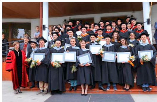
The Graduation Ceremony, at LvBS