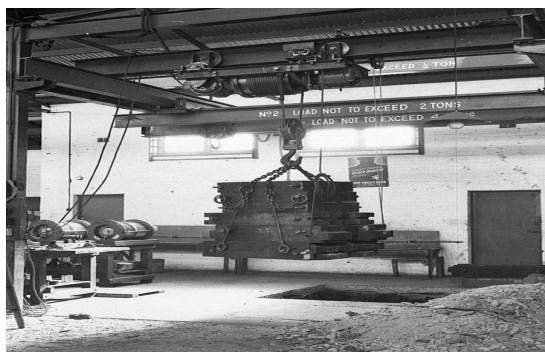
[Figure 7] Just letting you know: an example of the Ration Commission's publicity campaign in a Sydney factory (back wall). Sam Hood, W orkshop Sceneq(undated) State Library of NSW: 10657.

The few scattered posters on the black market which appear to have been catalogued seem rather shabby in comparison to the brightly coloured recruitment campaigns. 29 Indeed many appear to have been put together, perhaps by the Ministry of Information, with an aim of doing it as quickly and cheaply as possible. However, the Second World War was different in the fact that government propaganda were generally less reliant on imperial sentiment so beloved by Australian artists during the Great War, and was instead directed to controlling behaviour. Of course as Peter Stanley has noted, there were benefits in simplicity: A successful poster was capable of only one interpretation. Most of the posters... did not seek a dialogue: they imposed, imparted, and impelled, but did not enquire. 30 In this sense simplicity was often best in getting the message across. Often they were strategically placed, such as in wartime factories against the temptations of pilfering vital supplies and selling them on at a profit. 31