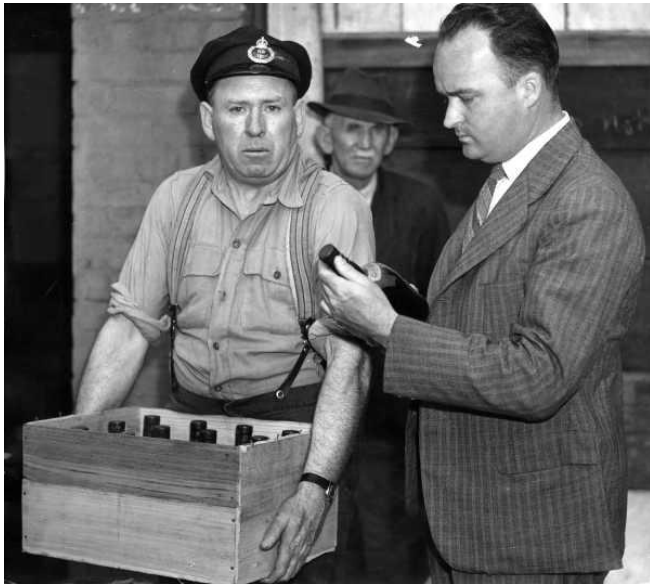
[Figure 4] All in a day's work: grim faced Customs officers in Sydney inspect an illegal cache of alcohol, circa 1943.

Civilian investigators meanwhile were mostly overworked, underpaid clerks, who no doubt harboured some resentment at being consigned to the home front, where the lack of military uniform meant that their efforts were unlikely to be recognised. Petty and often officious, it was to these public servants that the task of compiling reports and carrying out investigations on suspects fell, and it was little wonder that corruption was a constant concern. However it was often the chronically understaffed local police which had to make most of the arrests.