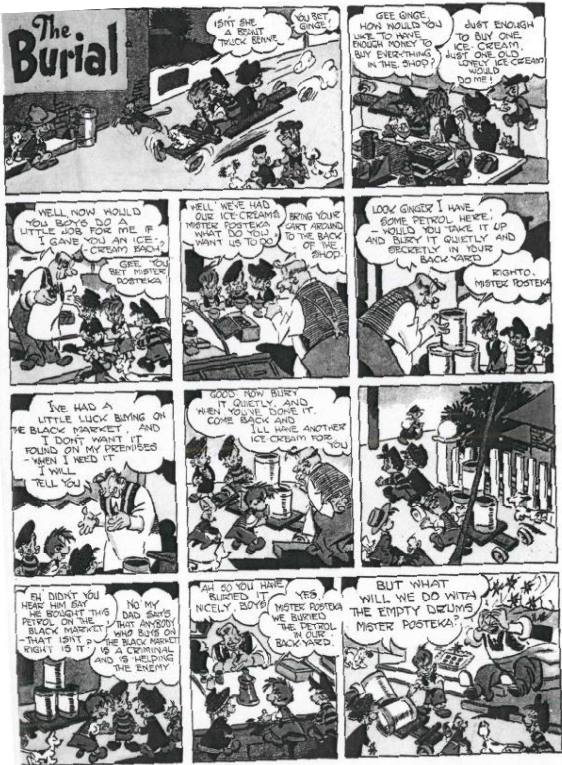
Below [Figure 12] the iconic children's cartoon character Ginger Meggs doing his bit for the war effort in thwarting black marketeers. Date unknown.