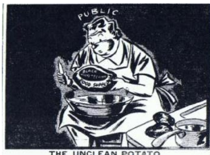
[Figure 3] The potato reads Black marketing, Food Supply Sunday Sun & Guardian 2/8/1942.

those in the outer areas or less established cities like Brisbane, there was little space for personal cultivation; perhaps another reason why the black market seemed more confined to the urban populace. Instead most people had to rely on the local grower's markets and barrow sellers who lined George Street where it was difficult to enforce price regulations. 55 Here the spatial divide between genders was less noticeable because it was the women who did most of the shopping, and thus, it is in this area where most breaches involving women occurred. As early as August, 1942 the Sun ran a large story on the presence of a black market in potatoes existing in Sydney markets. Potatoes had not yet been rationed, but it seems that demand had outstripped supply and some traders were taking advantage of the situation by raising their prices. 56