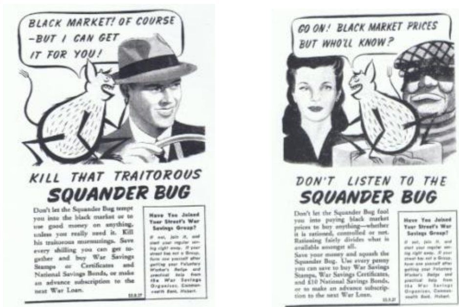
[Figures 8 & 9]: The famous Squander Bug campaign targeted both male and female buyers its efforts to promote austerity.

The government made little attempt to hide the fact that the new Black Marketing Act of 1942 would make an example of offenders. The government wished to appeal to the individual's sense of honour; that the shame of being branded a black marketeer would be enough to deter potential violations of the law. The 1942 legislation required guilty persons to place a notice of conviction on their business premises. If that was not deemed serious enough the government could also order the particulars of the case to appear on business letterheads, and direct media coverage on the case. 33 Such approaches have many benefits, especially for a cash strapped system during wartime, as they were, (and are), cheap and easy to initiate, however as David Freidrichs points out Social policies based principally on moral outrage can