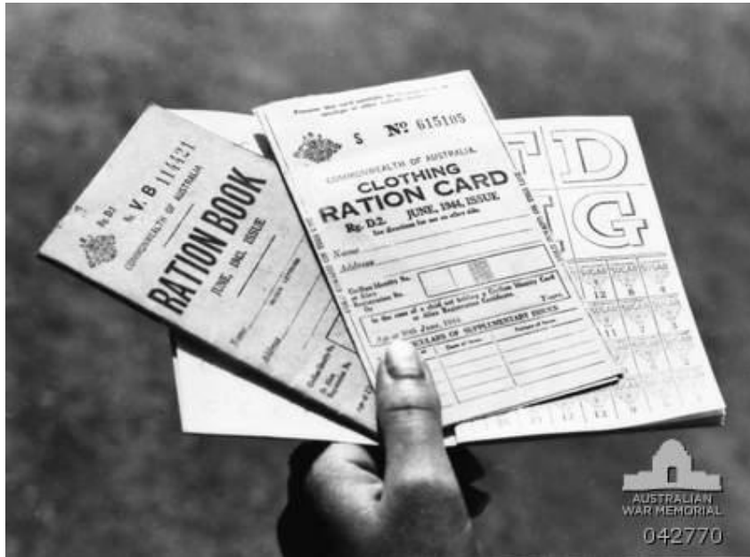
[Figure 2]. The little book which caused so many problems: a ration book and clothing card from 1944. The lettered sections in the bottom right indicate specific categories of rationed items.