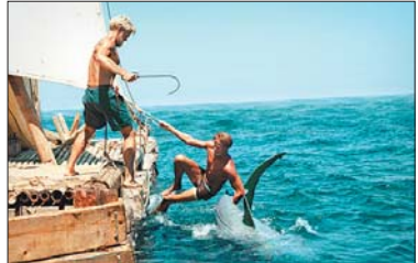
Scenes from the movies Kon-Tiki (left) and Seven Psychopaths .

The thriller-horror genre comes to full bloom in another 11 films that will be screened in various segments of the festival like Made in