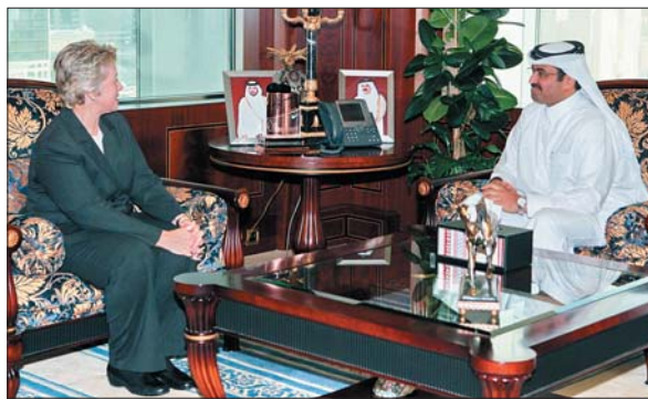
Minister of Energy and Industry HE Dr Mohammad bin Saleh al Sada with Mayor of Houston Annise Parker, in Doha, on Thursday.