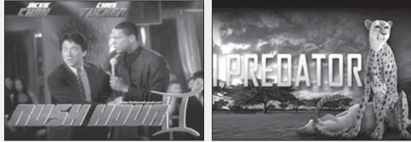
9:00 pm MBC 2: RUSH HOUR 2