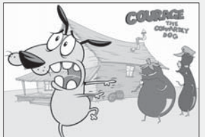
10:10 pm Cartoon Network: COURAGE THE COWARDLY DOG