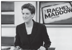
8:19 pm QSN News: LIVE MSNBC THE RACHEL MADDOW SHOW