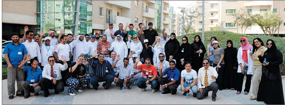
Hamad Medical Corporation employees take part in a walkathon to promote health and wellness, in Doha, recently.

"We were surprised by the number of staffers and their families at the walkathon. The turnout was much more than we expected considering this was the first time we held the event," said Dr