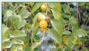
One of the plants in the Quranic Botanical Garden.

The Holy Quran is rich with plant life with reference to plants native to the Muslims region, including those in the desert and Mediterranean climates. It also refers to tropical