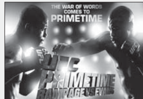
7:00 pm QSN Sports 4: UFC PRIME TIME