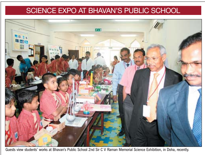
Guests view students' works at Bhavan's Public School 2nd Sir C V Raman Memorial Science Exhibition, in Doha, recently.