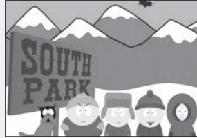
10:30 pm OSN Comedy: SOUTH PARK