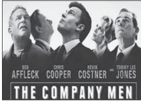
7:00 pm OSN Cinema: THE COMPANY MEN