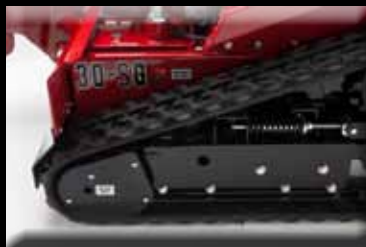
Time-tested track design absorbs impact and provides stability