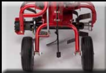
Tilling depth can be adjusted by setting the wheel height