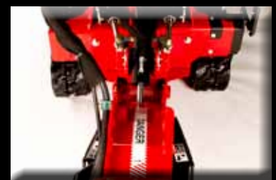
Hydraulically driven, center-mounted cutter wheel provides 134° head swing.