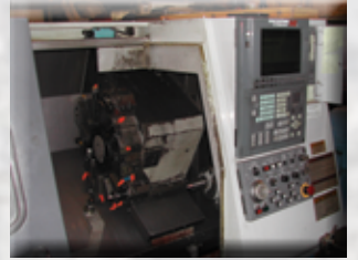
CNC Operations - Barreto manufactures over 80% of their parts in-house to ensure quality and keep parts in stock for customers

Call 1-800-525-7348 or visit us on the web at www.barretomfg.com for more information.