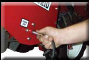
Marked grease zerks allow for easy maintenance