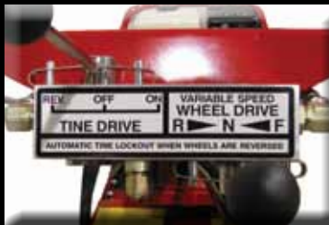
Simple controls are easy to learn and easy to operate