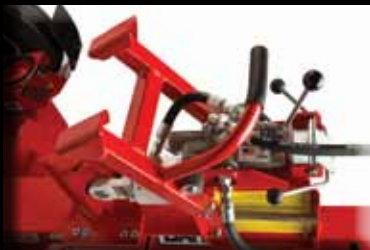
Spring loaded wedge cleaner