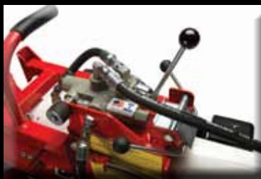
Two handed control provides operational safety