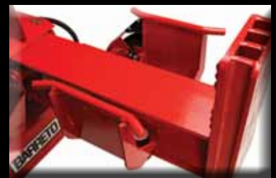
Cushion mounted log cradle is designed to snap out of the way when using the splitter in the vertical position