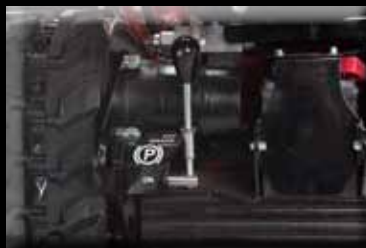
Counterbalance valves on each track drive prevent the track motors from slipping