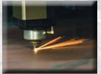
Laser Cutting Accuracy