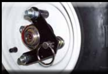
Hubs unlock to free-wheel the tiller when the engine isn't running