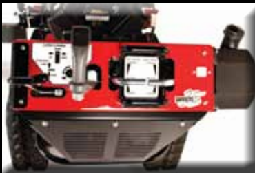
Easy controls operate the track drive and cutter wheel