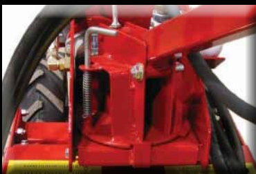
Pivoting handlebar allows closer tilling along houses or fencelines