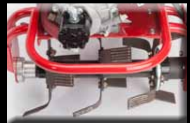
The hardfaced tines are reversible making it easy to dislodge obstructions