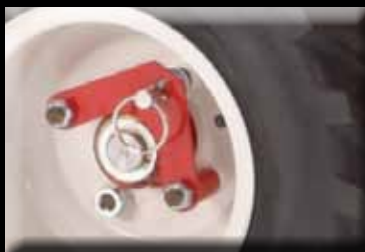
Hubs unlock to free-wheel the tiller when the engine isn't running