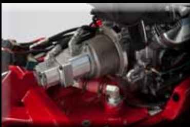
The engine is coupled to two gear pumps: a larger pump drives the cutter wheel and a smaller pump works the tilt and swing