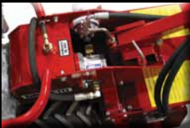
All hydraulics are easily accessed for maintenance and repair