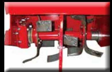
Hard faced, counter-rotating tines cut through sod and hard packed soil