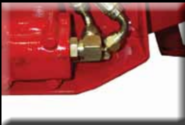
Hydraulics are easily accessed for maintenance and repair