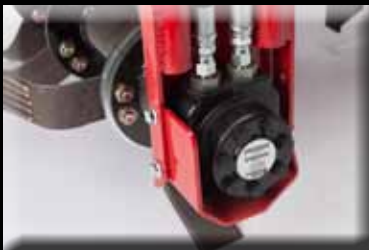
The protected tine motor provides hydraulic direct drive to the shaft