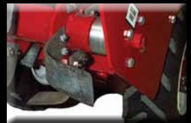
Counter-rotating tines cut through sod and hard packed soil