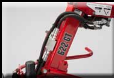
1.5 gallon hydraulic reservoir reduces maintenance costs