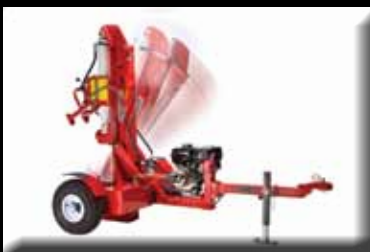
The rugged, heavy duty design will hold up to the challenges of the job