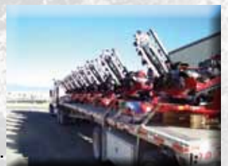
Ready to Ship