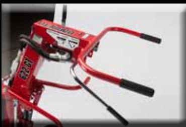
Adjustable handlebars feature a one lever control to engage tines