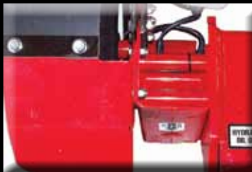
Torsion axle suspension