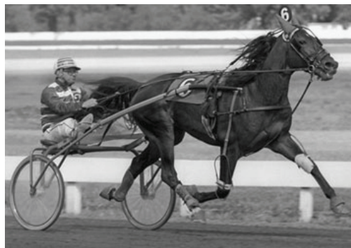
IMMORTAL GARLAND LOBELL