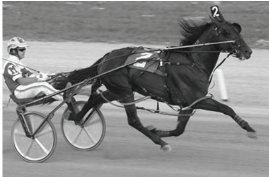
LIVING HORSE HALL OF FAME SOMEBEACHSOMEWHERE