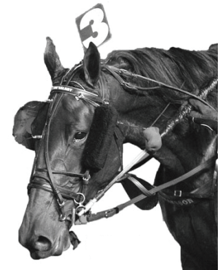
2014 HORSE OF THE YEAR JK SHE'SALADY