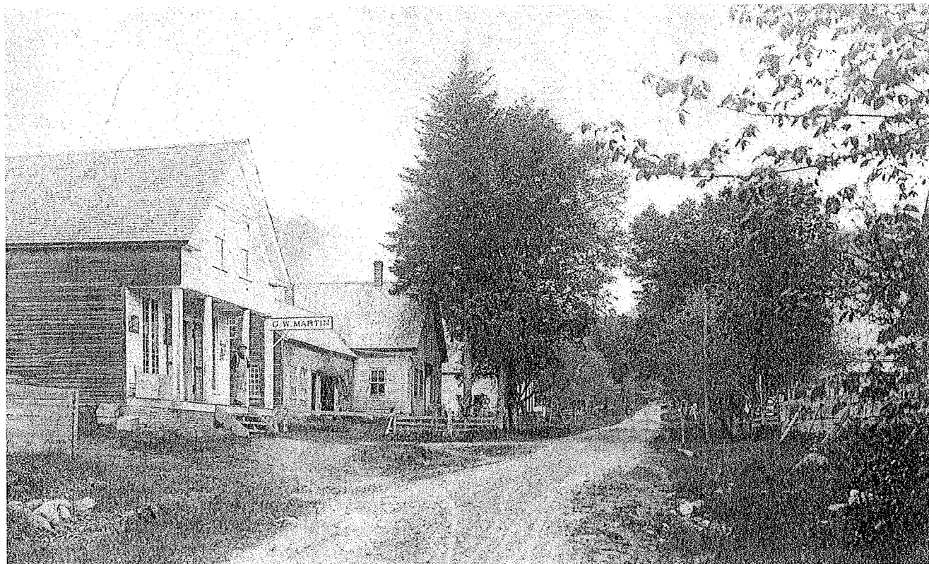
Facing west on Houghtonville Road at east end of historic district

Houghtonville Historic District Grafton, Windham County, Vermont