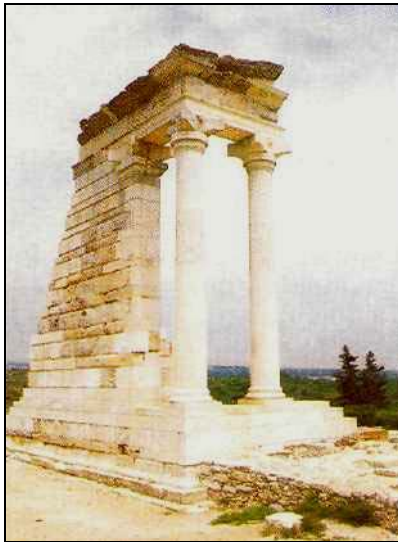
A postcard of the trade