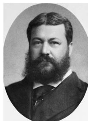
Henry Hobson Richardson, elected 1878.