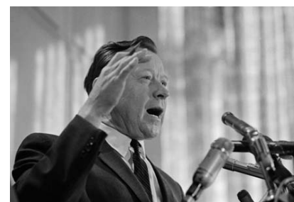
Walter Philip Reuther, elected 1952.

Career description: Government official (legislator); Lawyer