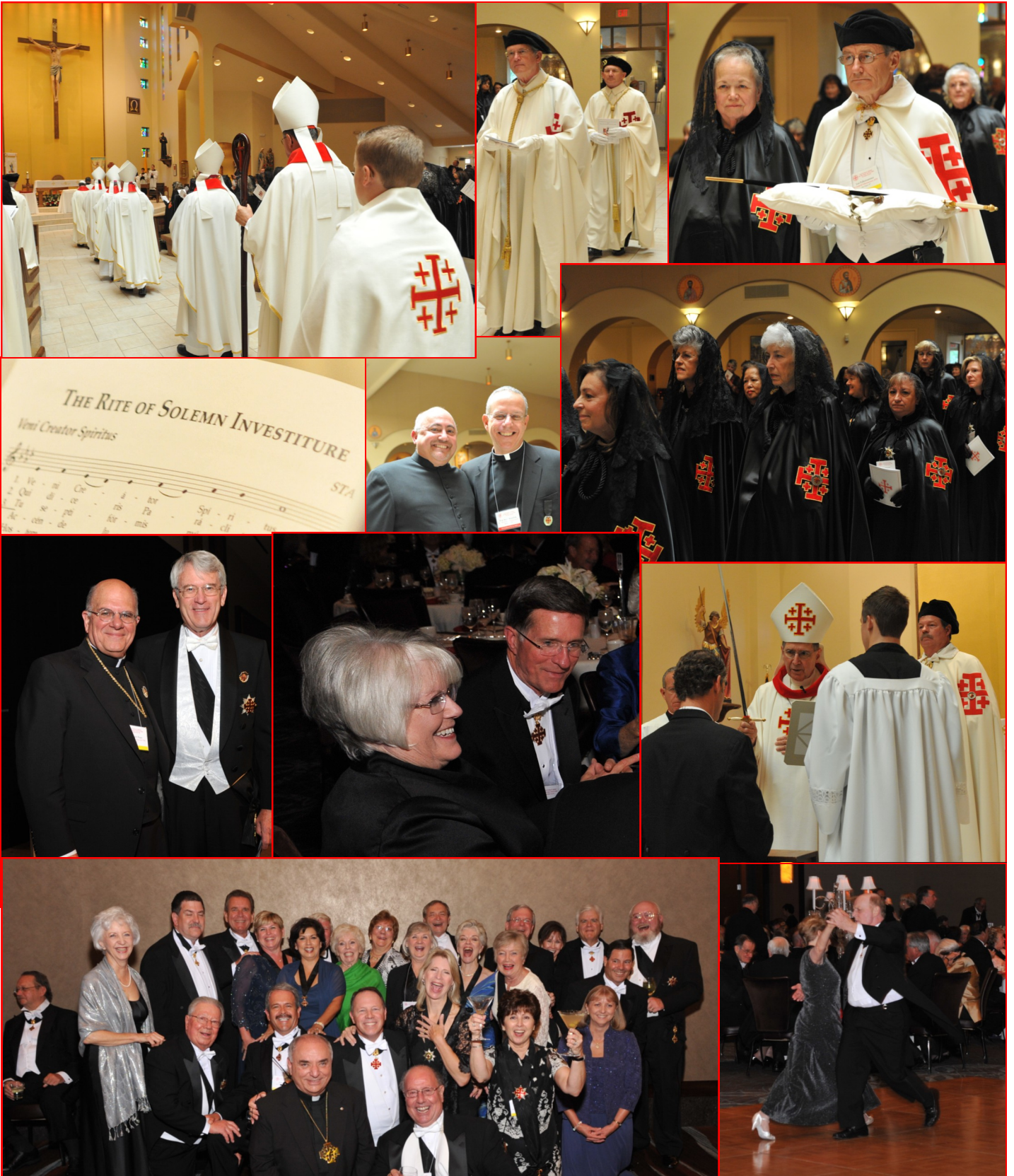
Photography by Tony Amat— www.areventphotography.com —Event Code “EOHSJ2011”