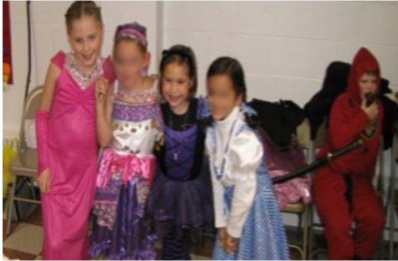
Sunday School Class (right)