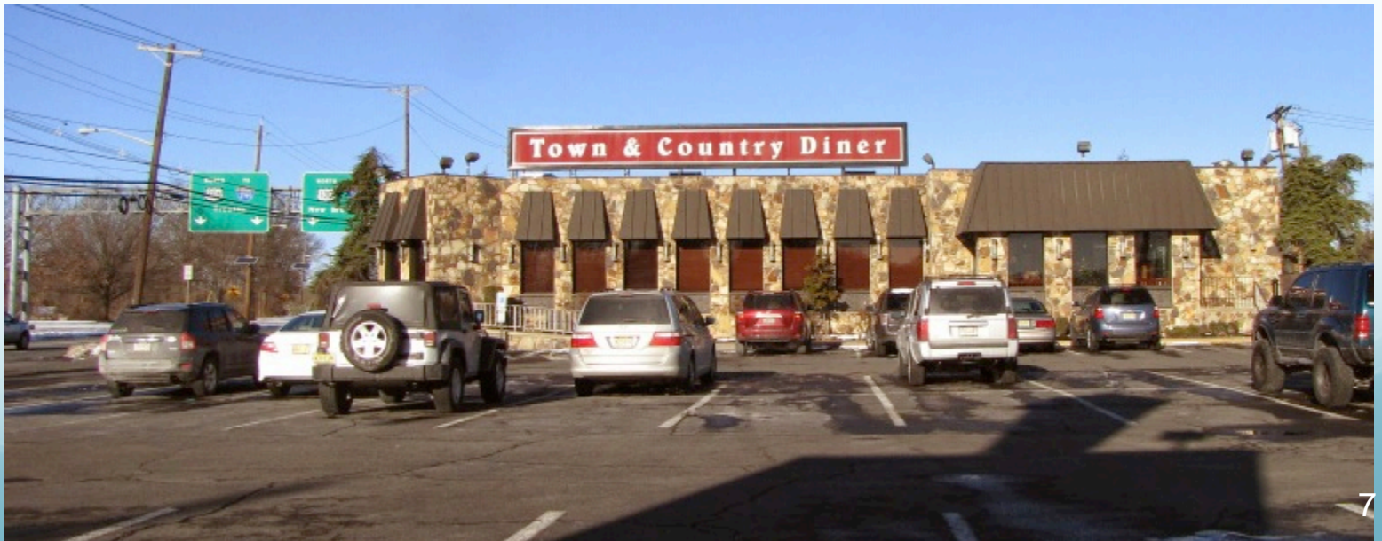
Town & Country Diner. (right) One of many in our area. Note the closeness to major highways