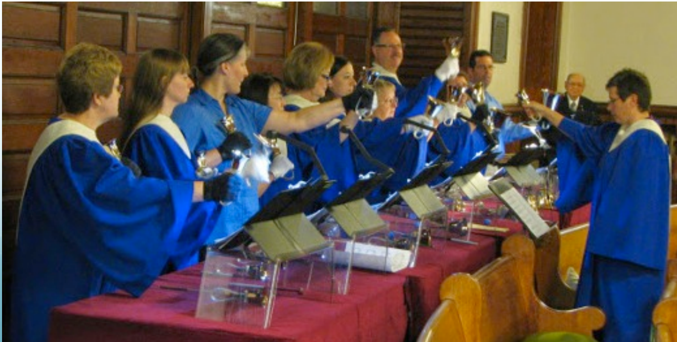
Praise Team (above left) Junior Choir (above right) Bell Choir (left)