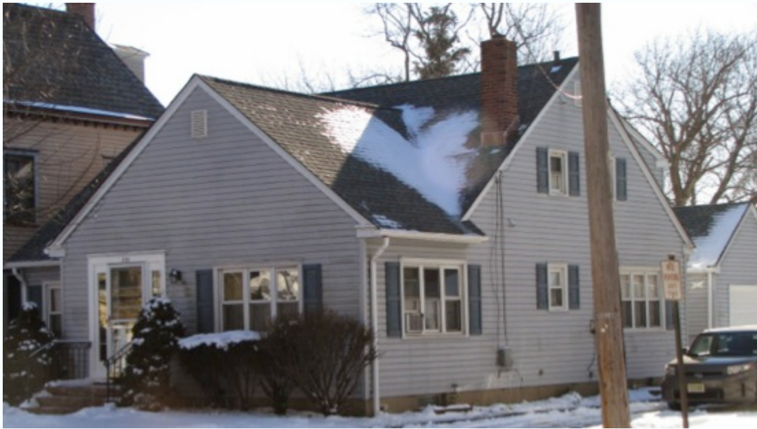
First Baptist Church Parsonage (top left)