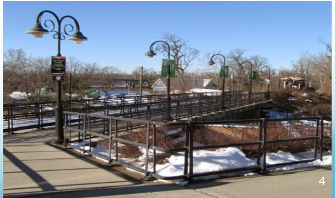
Bordentown Light Rail Train Station (right)