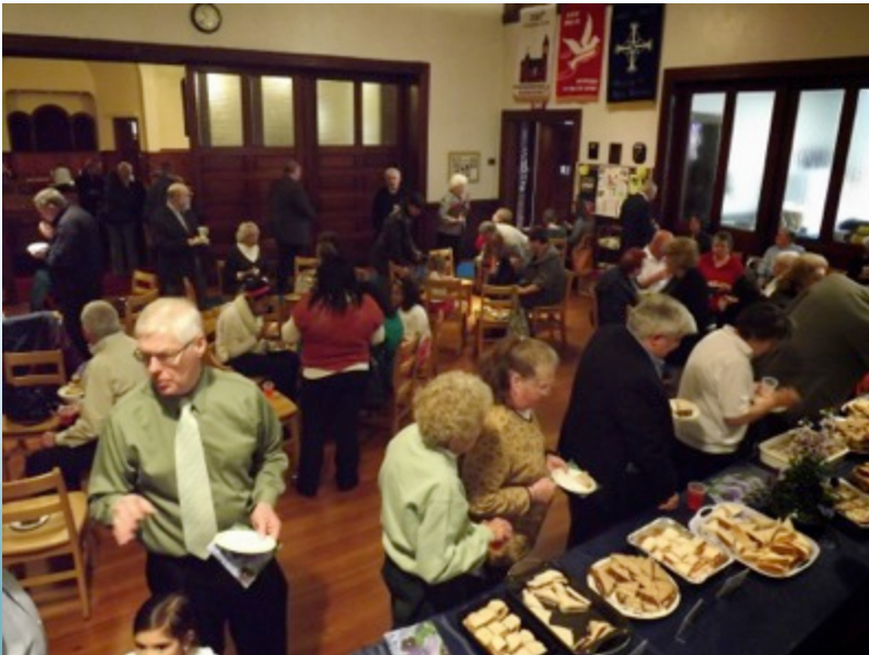
Coffee Hour (below left and right)