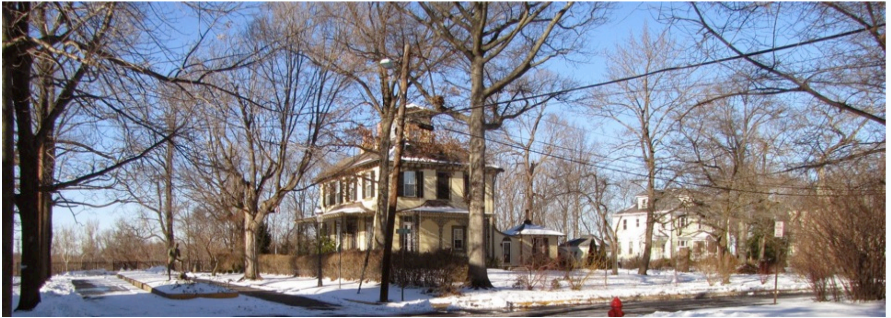
House overlooking river with Thomas Paine Statue, author of "Common Sense" and other Revolutionary War papers (above)