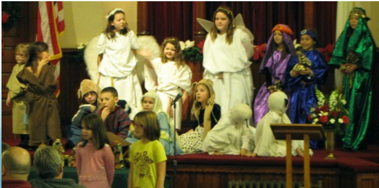
Children's Story (above left)