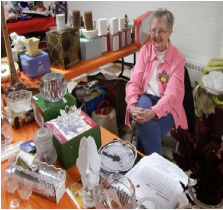
Fall Festival (left and below left)