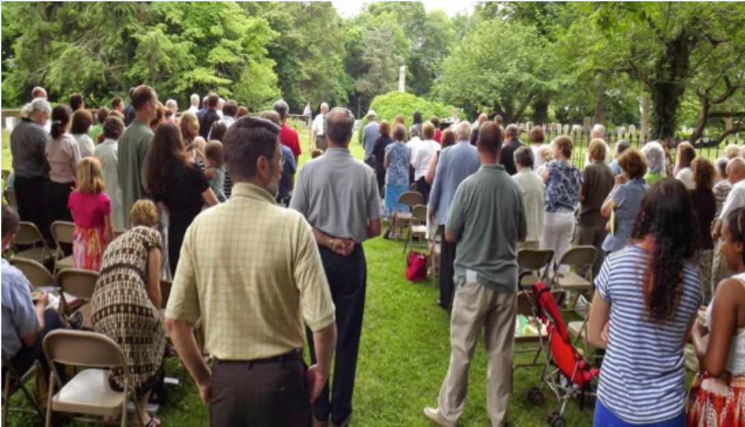
Outdoor service (left)