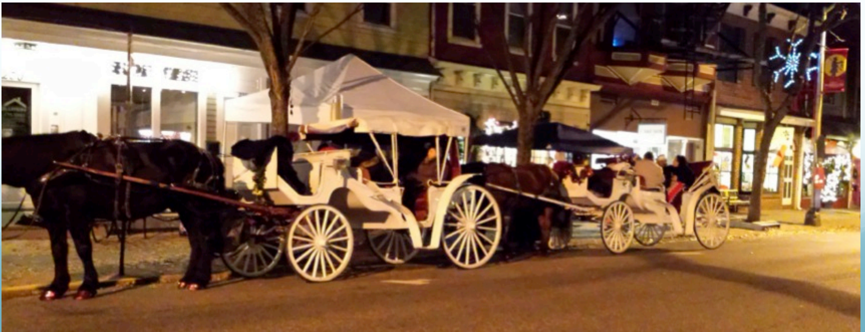
Horse-drawn carriage rides during winter holidays (below)