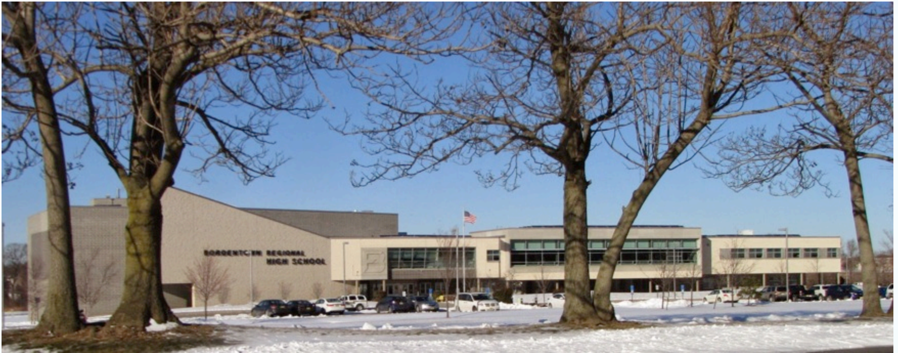
Bordentown Regional High School (above)