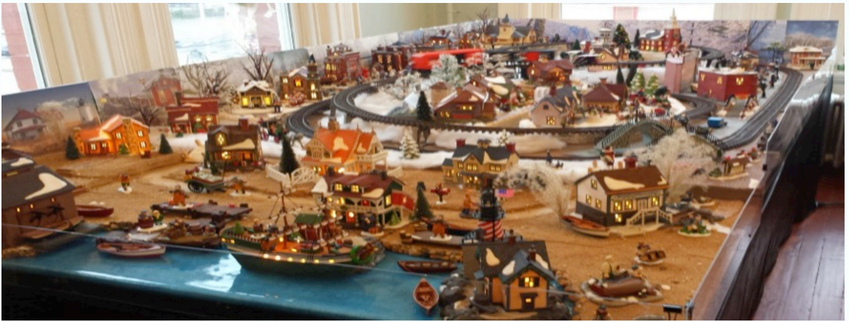
Bordentown City Train Display (above)