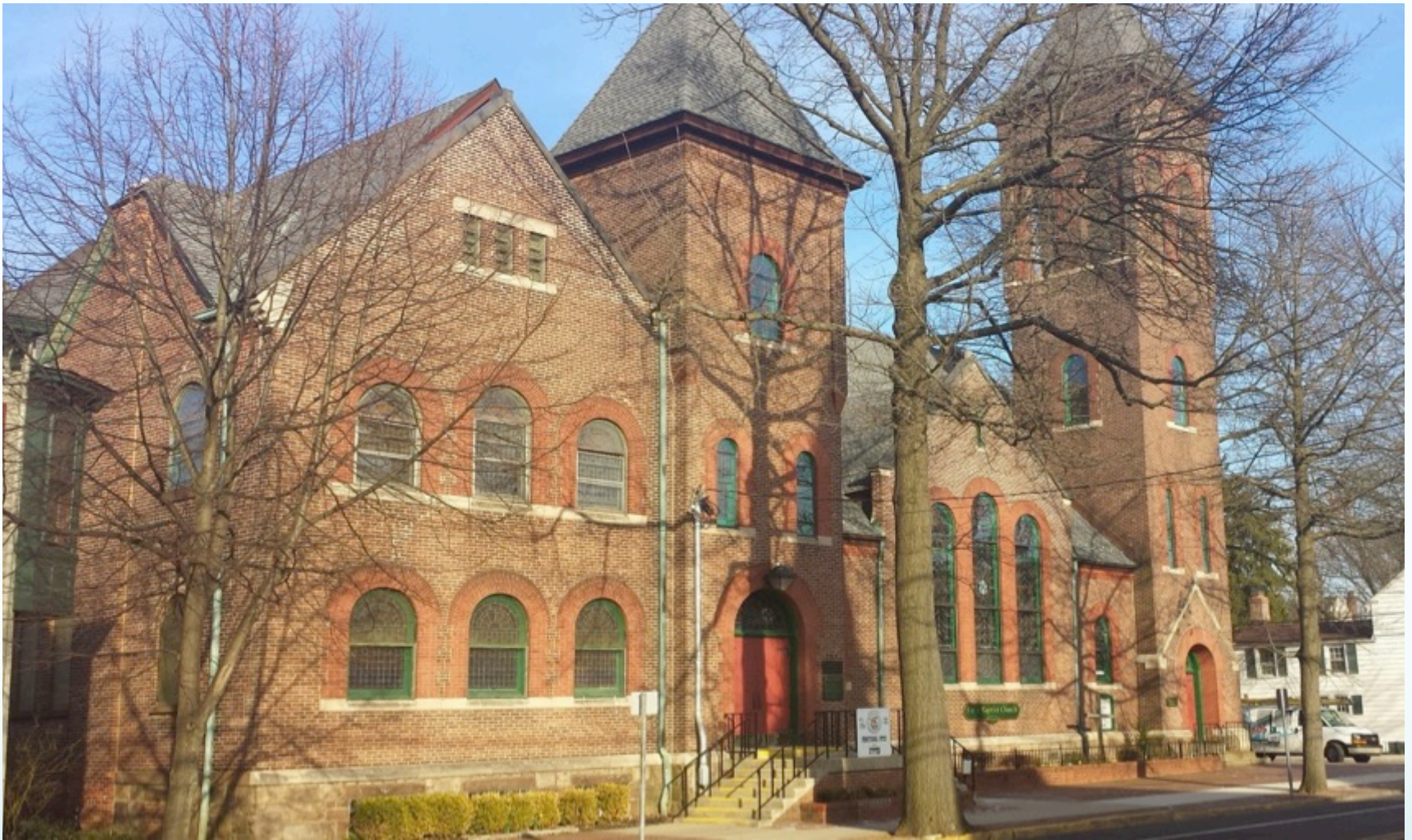
First Baptist Church Est. 1751