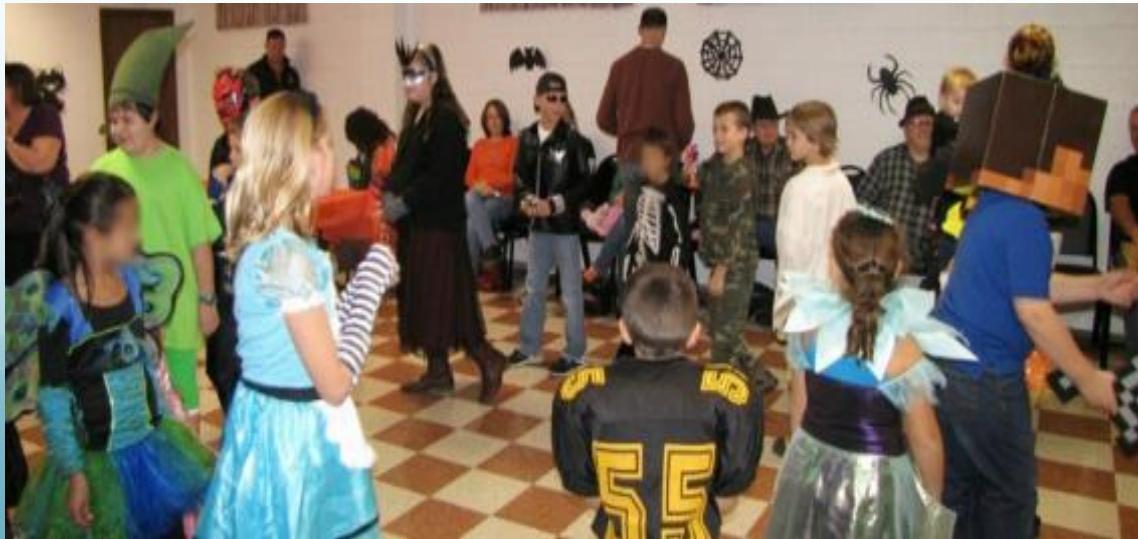
Children's Harvest Costume Party (above left and left)