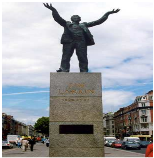
Riots during the 1913 'Lockout' and the Statue of its leader James Larkin

Further upheaval would hit the city three years later when almost one and half thousand rebels captured many of the cities key buildings, most notably the General Post Office. Seven days of bitter fighting saw almost four hundred people killed and the destruction of many of the cities most important buildings. The subsequent mass executions of rebels would swing popular support in favour of the revolution.