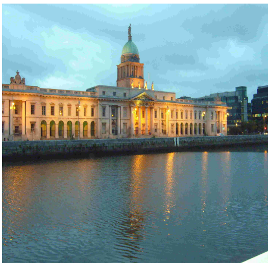
Medieval Temple Bar and the Georgian Customs House