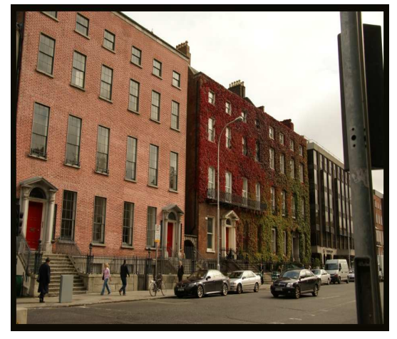
Kildare House (now Leinster House)