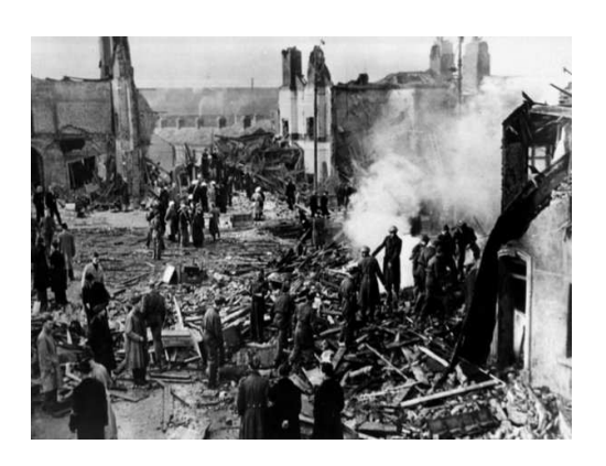
The North Strand Bombings of 1941

Although Ireland's neutrality allowed Dublin to remain relatively unscathed by the Second World War, the city was accidentally bombed by the Nazis four times. The most serious of these bombings occurred on 31<sup>st</sup> May 1941 killing 34 civilians. Dublin did not escape the economic costs of the war either. The city endured heavy rationing during the war which would continue over the following decades.