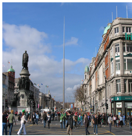
O'Connell Street old and new

In fact Temple Bar and Grafton Street (both popular tourists attractions for their nightlife and shopping respectively) are the few remaining parts of the city which escaped this Georgian reconstruction and maintained their medieval charm.