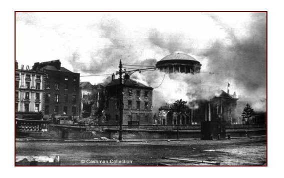
The 1916 Rising and the shelling of the Four Courts during the Civil War of 1923