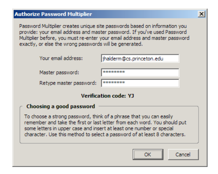
Figure 1: Before using Password Multiplier for the first time on a new system, the user needs to "authorize" it. This involves a one-time computation on the user's email address and master password that takes around 100 seconds. The result is cached for future use.

One of the principal challenges we faced was achieving the proper balance between attack resistance and user convenience. A brute force attacker would choose the fastest available hash implementation. To make the attacker's job more difficult, we also need to choose a fast implementation so that we can perform as many hash iterations as possible within the longest delay we deem acceptable—100 seconds for the one-time initialization and 100 milliseconds for each subsequent password generation. Mozilla's interpreted scripting language is not efficient enough to meet these performance requirements, so we implemented the iterated hash functions in compiled platform-specific XPCOM objects. These employ the highly-optimized SHA-1 hash