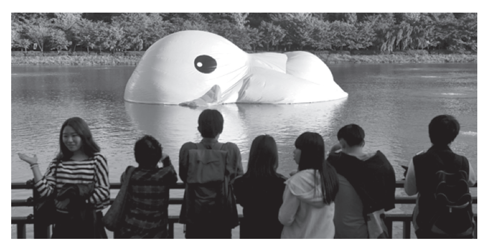
Figure 3. "People take pictures of a giant yellow rubber duck that deflated while floating in Seokchon Lake, southeastern Seoul, yesterday. The organisers of the Rubber Duck project in Korea said that the art installation would be soon be pumped up again. The large Rubber Duck, created by Dutch artist Florentijn Hofman, is on display in Seoul until Nov. 14." (Kim, 2014)

The small wings placed on the sculpture are more easily noticed as the viewer approaches the exhibit. The wings reinforce the unrealistic, non-functional and unnatural existence of this public spectacle. They are purely decorative and disproportionate to what they should be on an actual duck. This duck, with no functioning parts is not going anywhere. This message runs counter to that of the nostalgic escape discussed earlier, and leads to skepticism, while the shallow promise for escape initially promised by the familiar image of the rubber duck continues to dwindle.