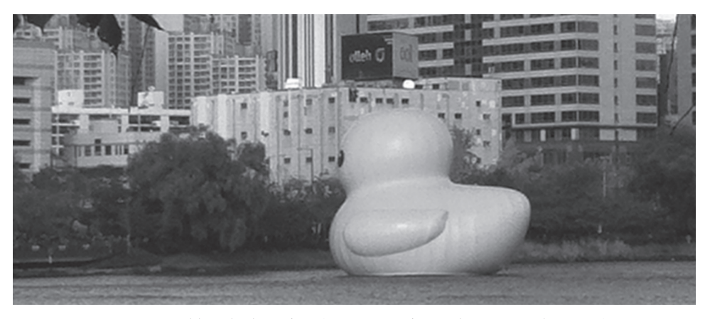
Figure 1. Rubber duck project

There was no admission charge to view the installation, although a small "pop-up shop" was set up nearby to sell souvenirs. Additionally, a makeshift gallery on the 6th floor of the mall had a collection of photos from other installations of the Rubber Duck project around the world and information about the artist. A similar gallery and shop was set up on the 9th floor of the Lottle World Amusement Park across the street (Figure 2).