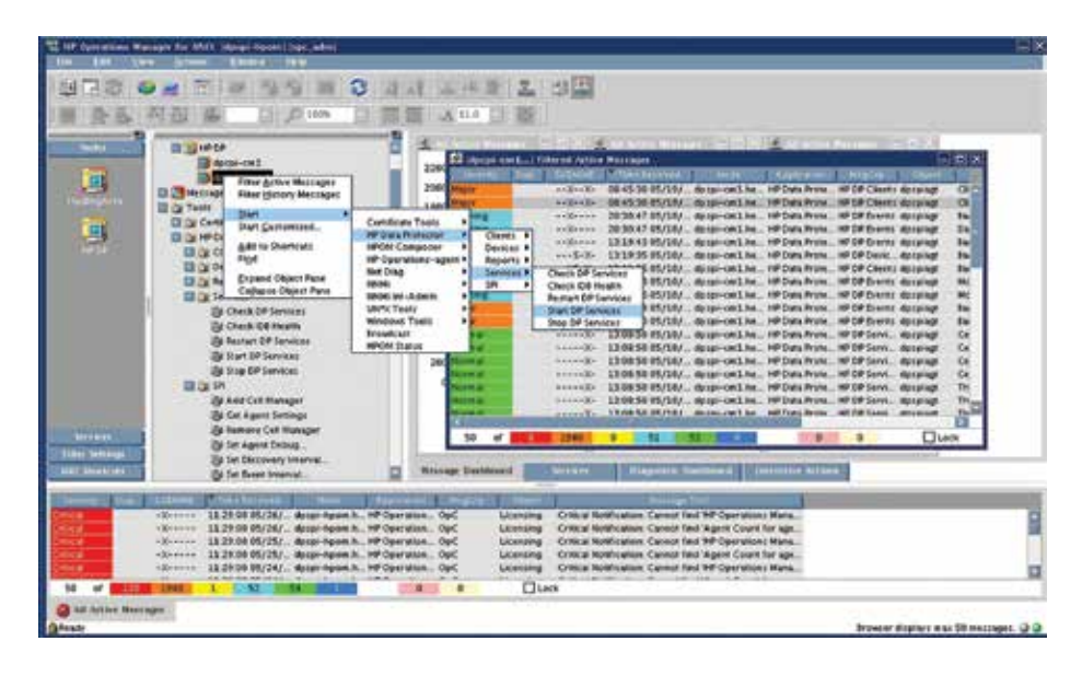
Figure 4. Assistive remediation enables administrators to respond actively to service states for HP Data Protector components