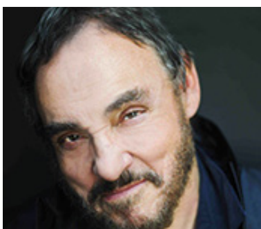
2015 Guest Artist, John Rhys-Davies