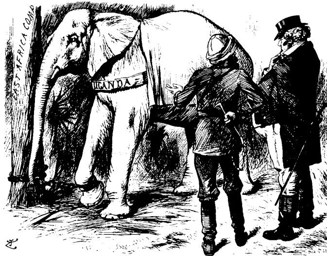
THE WHITE ELEPHANT

PUNCH, OR THE LONDON CHARIVARI.—(October 22, 1892.)