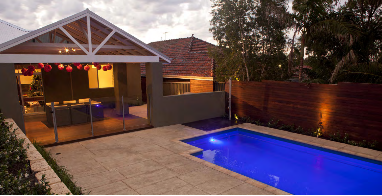
The striking sapphire blue pool and the modern alfresco area stand out as the highlights of the backyard makeover in this home in Wembley.

The transformation of this Wembley garden is so complete that the owners are now addicted to the outdoor life, reports Ann McRae