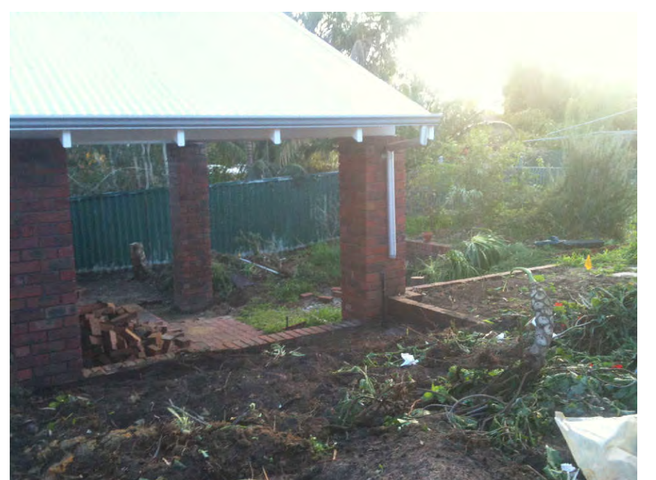
The overgrown and desolate backyard before the start of the project.

Contact details: Sam Keats at Living Environs on 9384 9672.