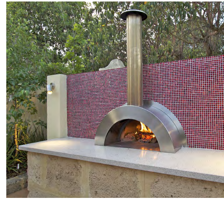
The pizza oven has a feature stainless-steel arch at the front.

customers a one-stop-shop and one price to pay.