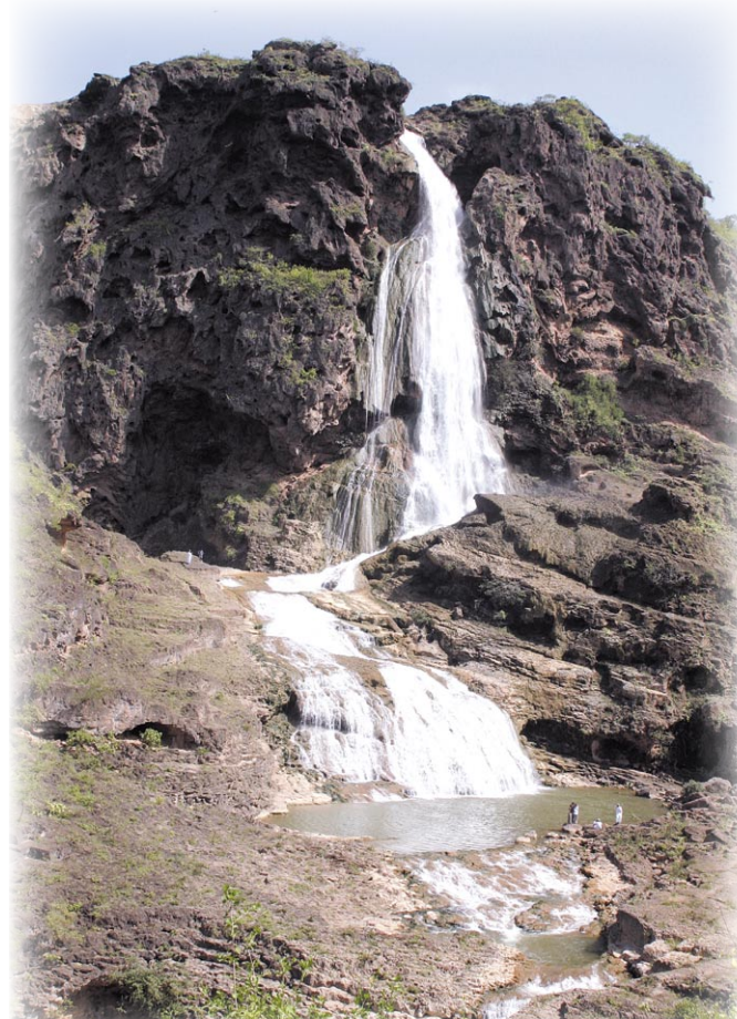
Visitors are dwarfed by the waterfall at Wadi Darbat.