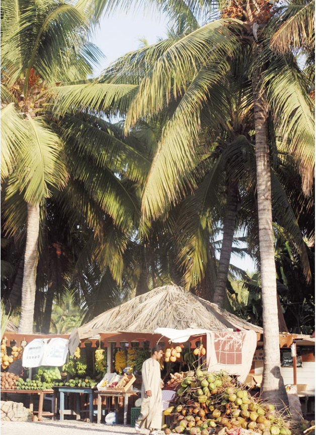
Many stalls selling fruit line to roads in Salalah.

While with Ahmed, we had driven past the Khareef Festival Grounds so I paid a visit to it during the evening. A whole section was given over to local cuisine. Innumerable flat breads were