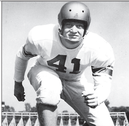
Pro Football Hall of Famer and Super Bowl Champion Chuck Noll was a 1952 UD team captain