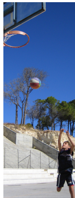
ECP Clubs and Participants