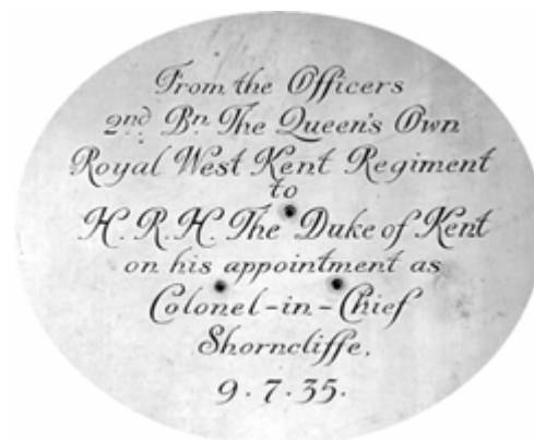
Lot 118 (interior detail)