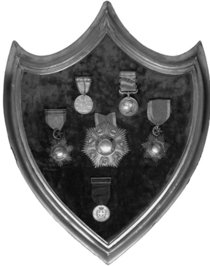
Lot 142 ( reduced )