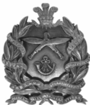
Ex Lot 109 ( reduced )

This lot forms part of a family group; see also lots 41, 42, 110, 134.