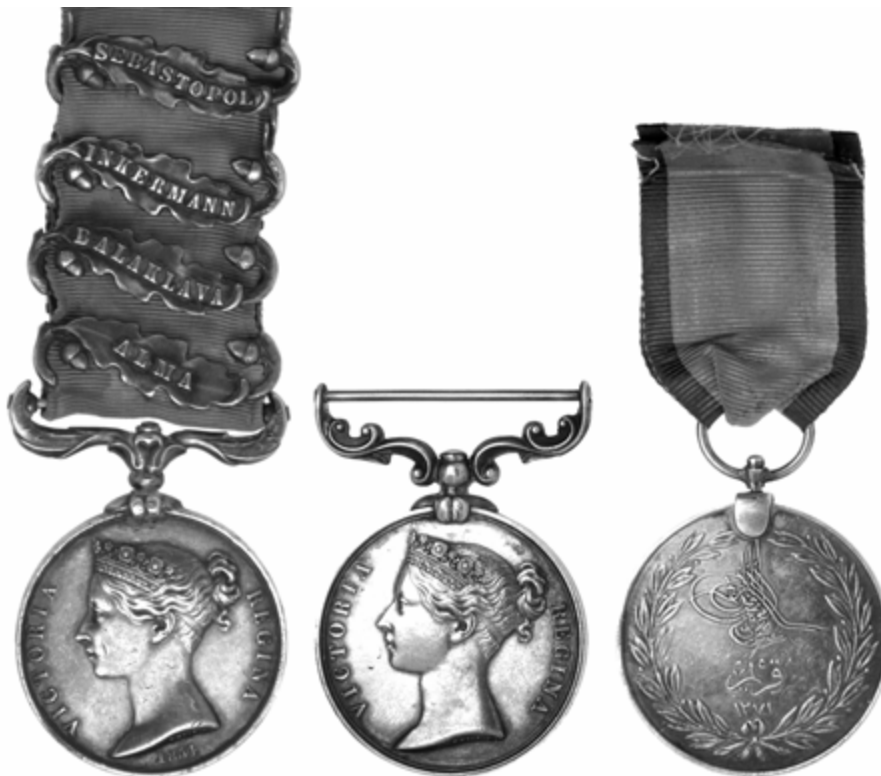
Ex Lot 21