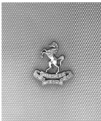
Lot 118 (lid detail)

Sweetheart's Brooch , Royal Engineers, Great War Period, in white gold, gold and enamels, the crown, wreath and royal cipher all set with diamonds, extremely fine £300-400