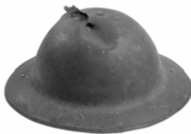
Ex lot 76