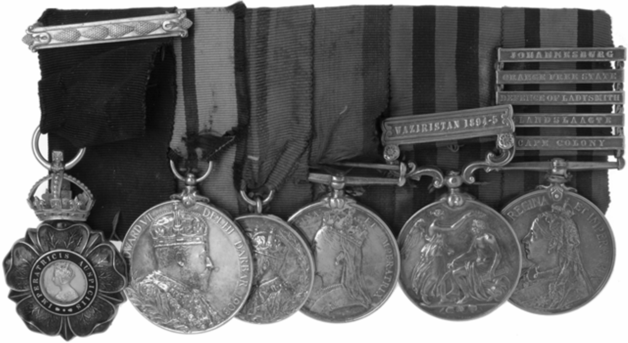
Ex Lot 41

41 C.I.E., K.C.V.O. Group, Seven, General Sir Beauchamp Duff, G.C.B., K.C.V.O, G.C.S.I., K.C.I.E., Commander-in-Chief India 1913-1916 , Order of the Indian Empire, type 2, Companion's breast badge, in gold and enamels, Royal Victorian Order, Knight' Commander's neck badge, in silver-gilt and enamels, reverse numbered K114, Delhi Durbar 1903, Delhi Durbar 1911, both unnamed as issued, Afghanistan 1878-80 (Lieut. R.A.), India General Service 1854-95, 1 clasp, Waziristan 1894-95 (Major Dy. Aptt. Adj. Gl.), Queen's South Africa 1899-1902, 5 clasps, Cape Colony, Elandslaagte, Defence of Ladysmith, Orange Free State, Johannesburg (Colonel I. Staff), all but the second mounted court style, generally very fine, the lot is offered with original warrants for the G.C.S.I., C.B. and C.I.E., original photographs of Sir Beauchamp Duff and Lord Hardinge, two cloth officer's shoulder patches and a photocopy of a letter of condolence from the Commander-in-Chief's Camp, India (7) £3,000-4,000