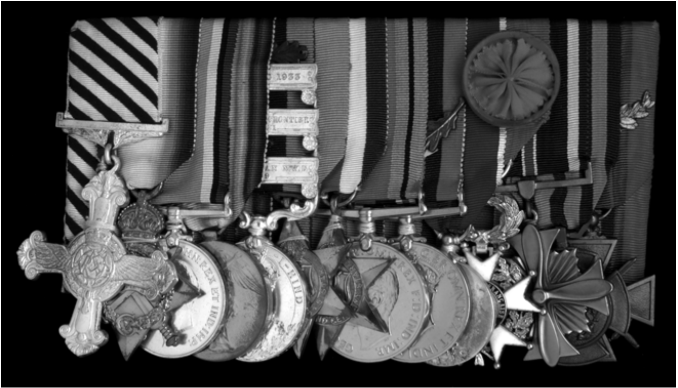
Ex Lot 174