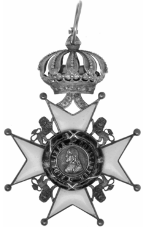
Ex Lot 133

131 Bulgaria, Order of St. Alexander , Type 2 with Royal Crown, Second Class neck badge, with surmounted swords replacing scrolls of crown for peace-time bravery, in gold silver gilt and white enamel, the circle around the central motto, the swords and upper part of the crown all set with rose diamonds, the gilt band set with four rose diamonds, two rectangular emeralds and a central rectangular ruby, 51 mm (excluding suspension), extremely fine £2,000-2,500