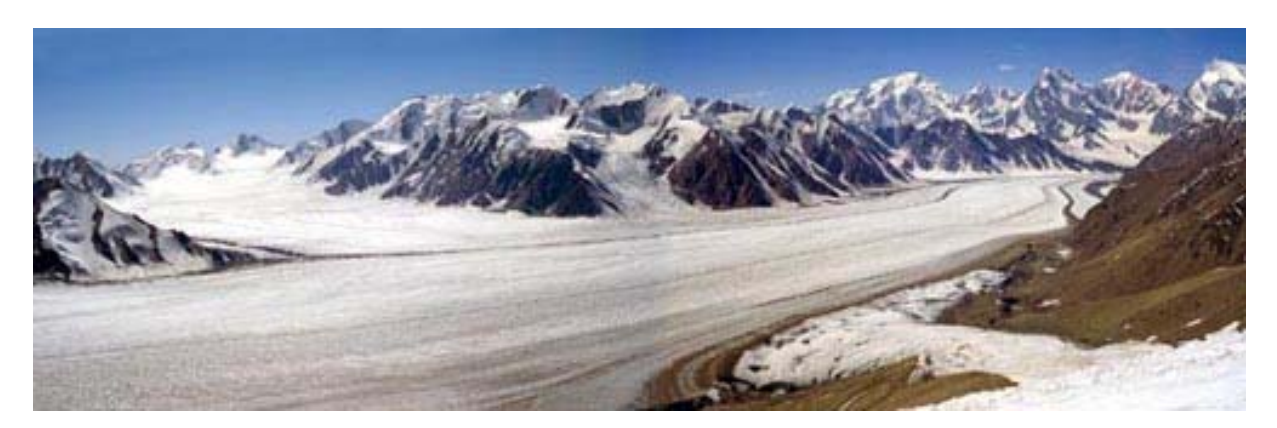
Figure 10: Fedjenko glacier in the Tajik National Park

The overall objective of the project is to improve transboundary biodiversity protection in the Tajik (Pamir) National Park and the Kyrgyz Alai National Park. This project approach includes the facilitation of meetings of environmental and scientific working groups to discuss, present and agree upon methodologies for transboundary biodiversity conservation in the Pamir-Alai area. One tool of the PA management is the development of alternative and sustainable income generating activities for the local population within and around the PATCA national park. These subcomponent includes small businesses, nurseries, traditional handicrafts and small scale eco-tourism.