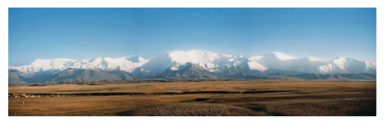
Figure 1: Pamir Alai high mountain ranges