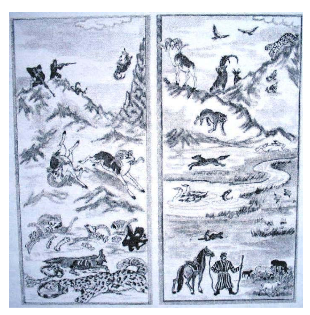
Figure 3: Drawings made by a Pamiri artist to illustrate environmental education materials in the frame of an ecotourism development program in 2004.