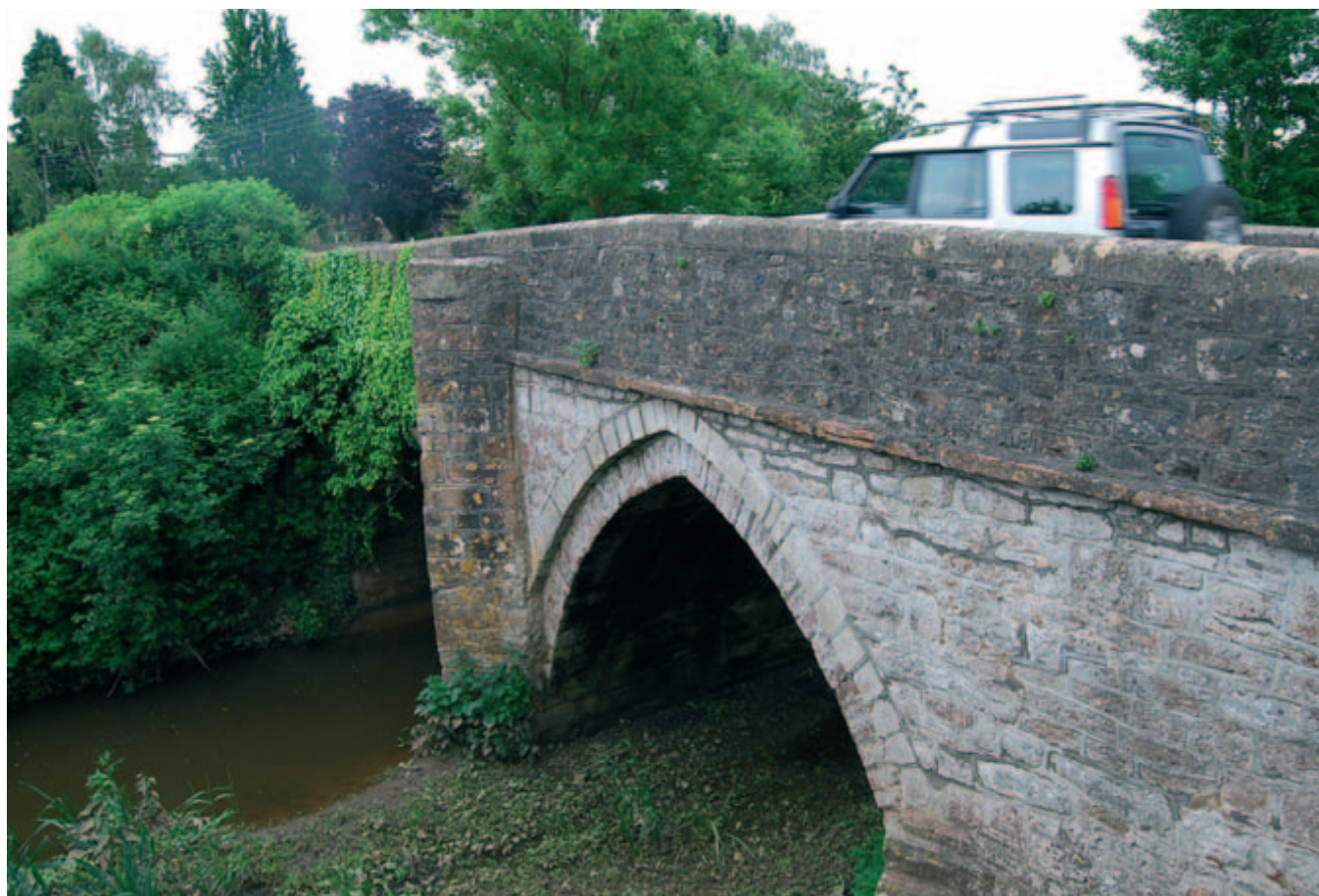
Historic Tun Bridge at Chew Magna was the scene of devastating flooding

Not only were homes ruined but power supplies were wrecked and there were fears for public health as the floodwaters were thought likely to be contaminated with sewage.