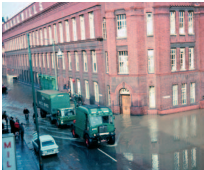
East Street in Bedminster, Bristol