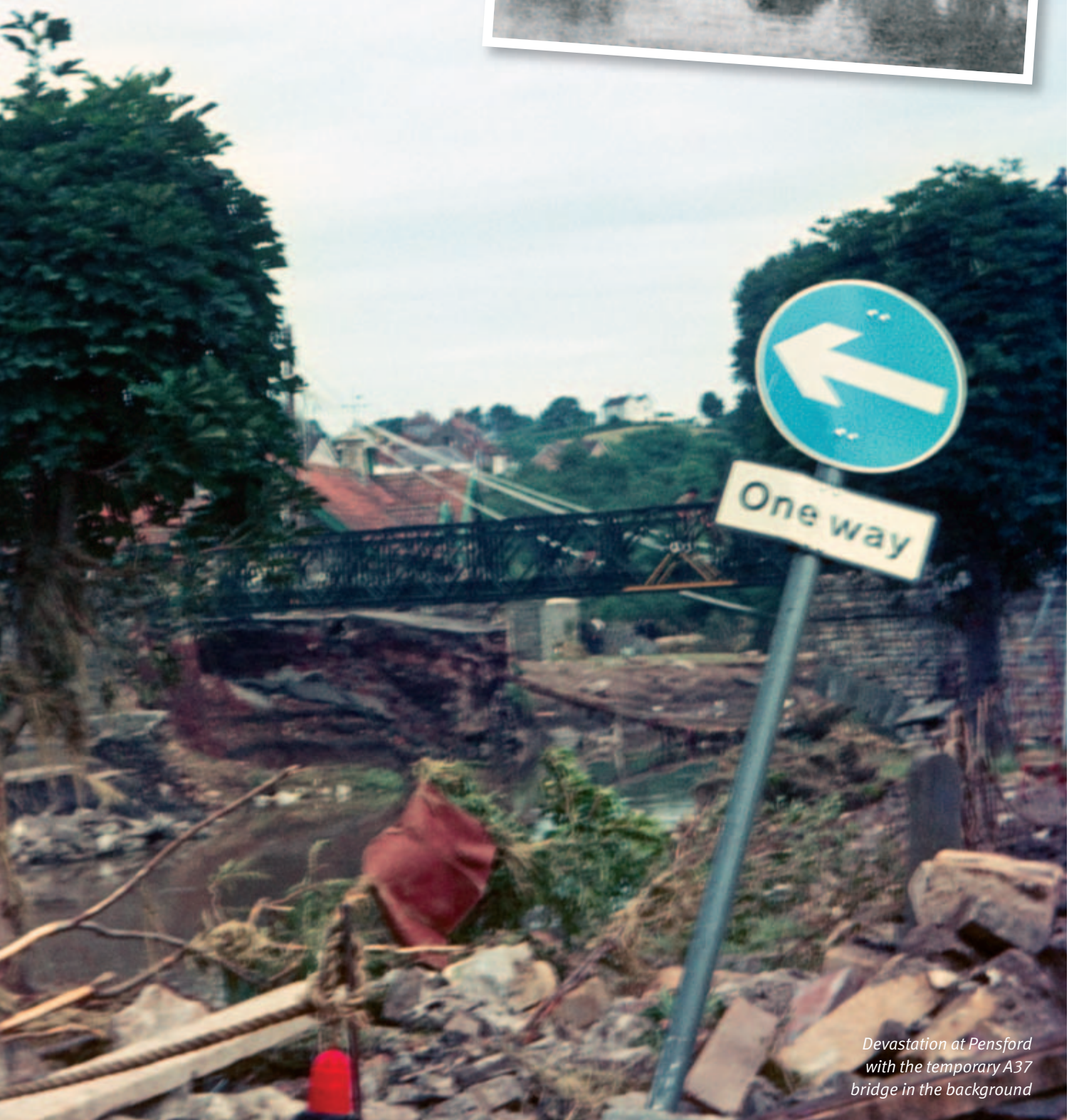
Devastation at Pensford with the temporary A37 bridge in the background