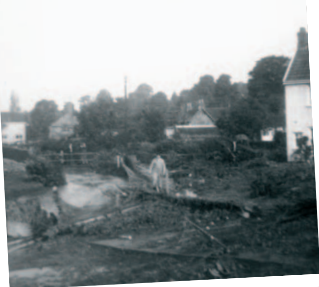
Flood wreckage in North Chew Terrace, Chew Magna

The two lorries he used as a coal haulier were so badly flooded that it was three months before they were roadworthy.