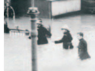
Flooding in Ashton, Bristol