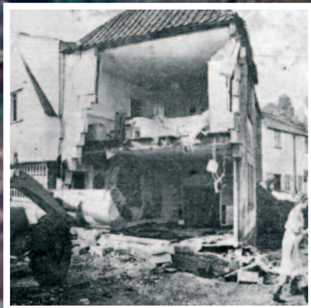
Remains of Bridge House, Pensford