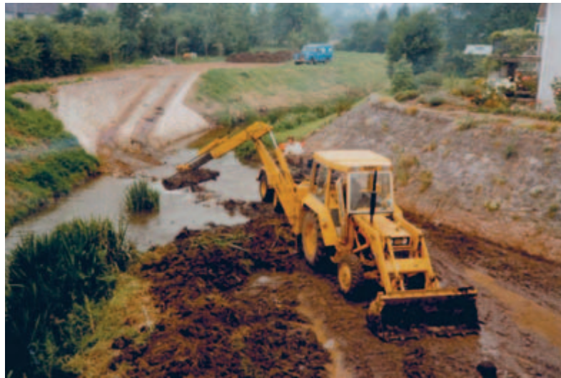
Clearing silt from the River Chew near Tun Bridge, Chew Magna

We inspect bridges and culverts weekly and clear blockages from them if they pose a flood risk. We also respond when members of the public report fallen trees, blockages, etc.