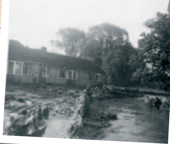
Sea of mud behind the Old People's Bungalows in Lower Batch, Chew Magna

But the water kept rising so Mr and Mrs Cox and their son and daughter, carrying the pet, went downstairs into chest-high water and out of the house. They used a wall to feel their way through the flood until they reached higher ground, where a neighbour took them in.