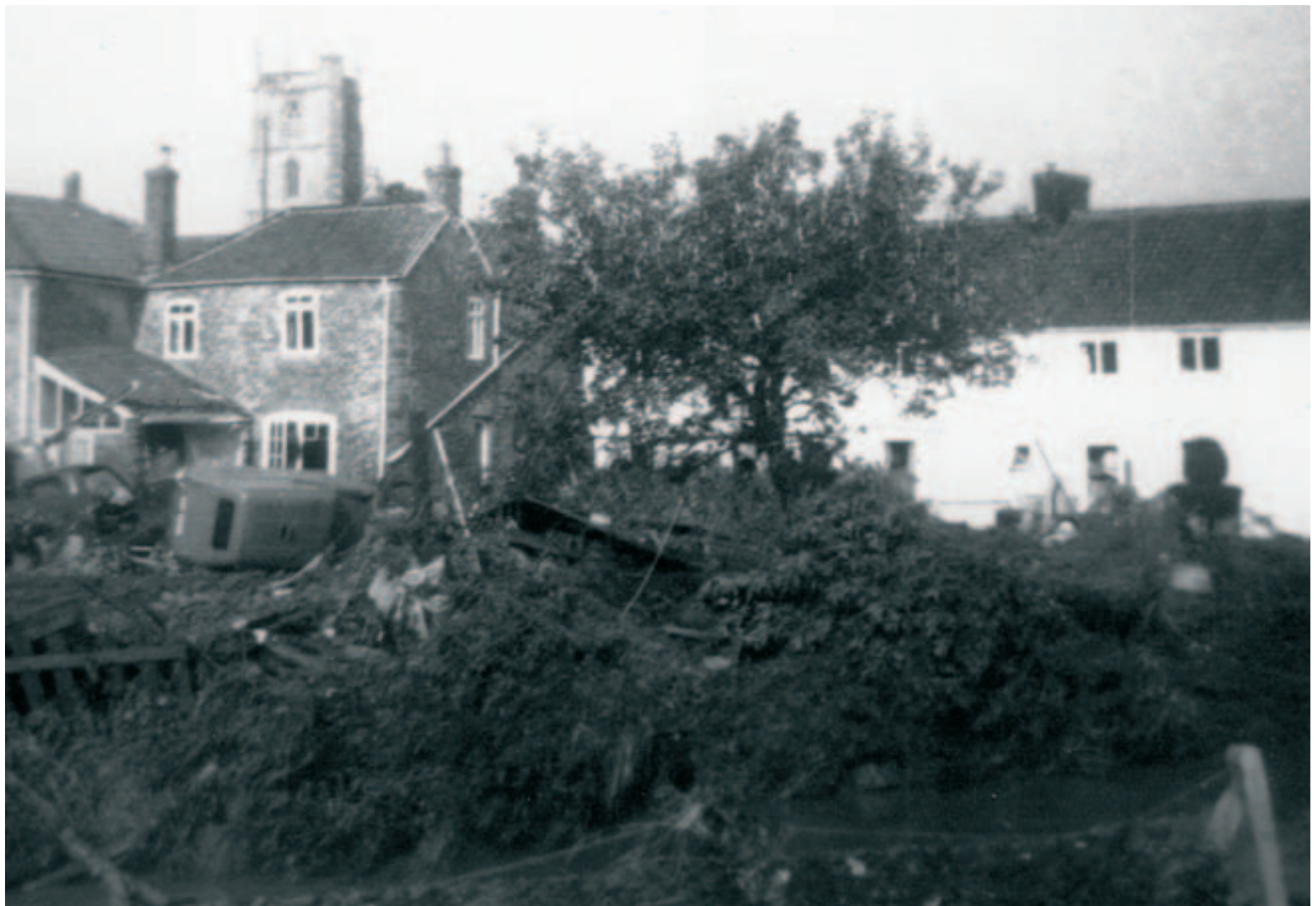
Devastation at the back of the Queen's Arms, Chew Magna