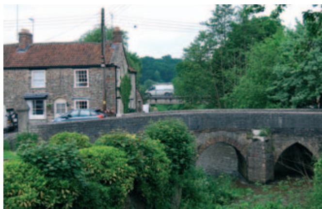
Old and new bridges in Pensford

All roads into the village were clogged with vehicles abandoned by their owners after being swamped. A bus and an ambulance were used as temporary shelters by stranded drivers and pedestrians unable to reach their homes.