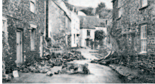
Wreckage in Church Street, Pensford