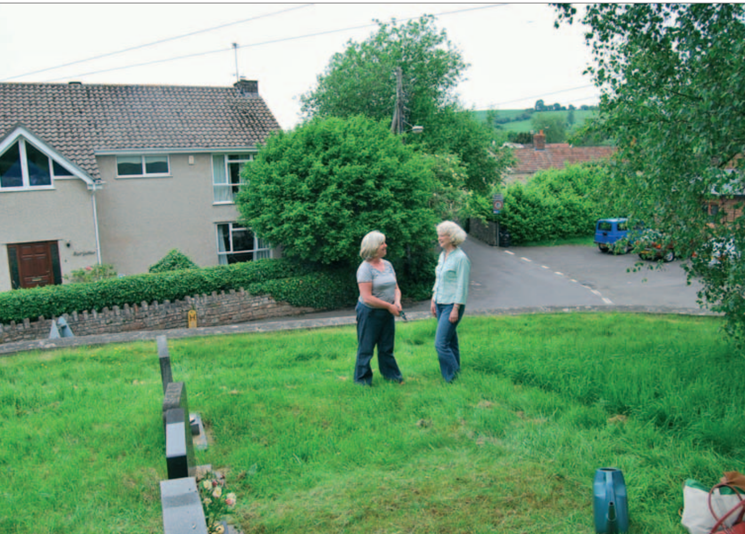
Silver Street at Chew Magna: floodwater reached the top of the ground floor windows of the house on the left