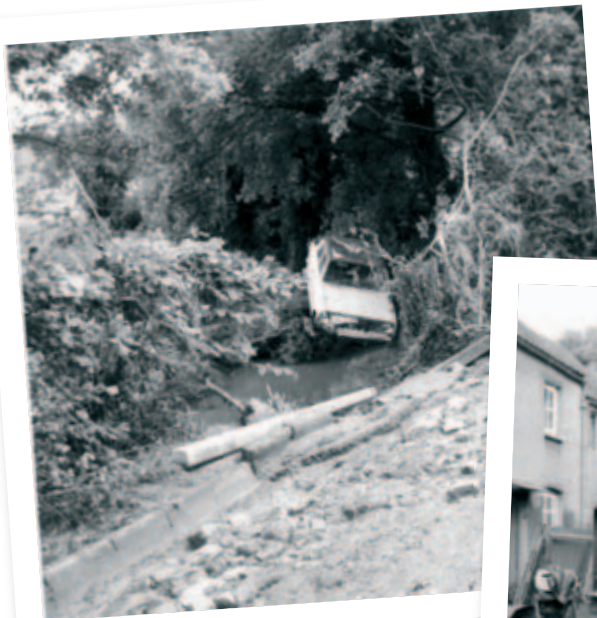
Scenes of devastation in Chew Stoke

Another resident, June Baker, used her Civil Defence training the next day to help people living in The Street. 'We got buckets of clear water and disinfectant and washed everybody's crockery and pots and pans because they were covered with dirt,' she said. 'The local doctor and vet came round with a hose and washed the mud off the furniture and walls.'