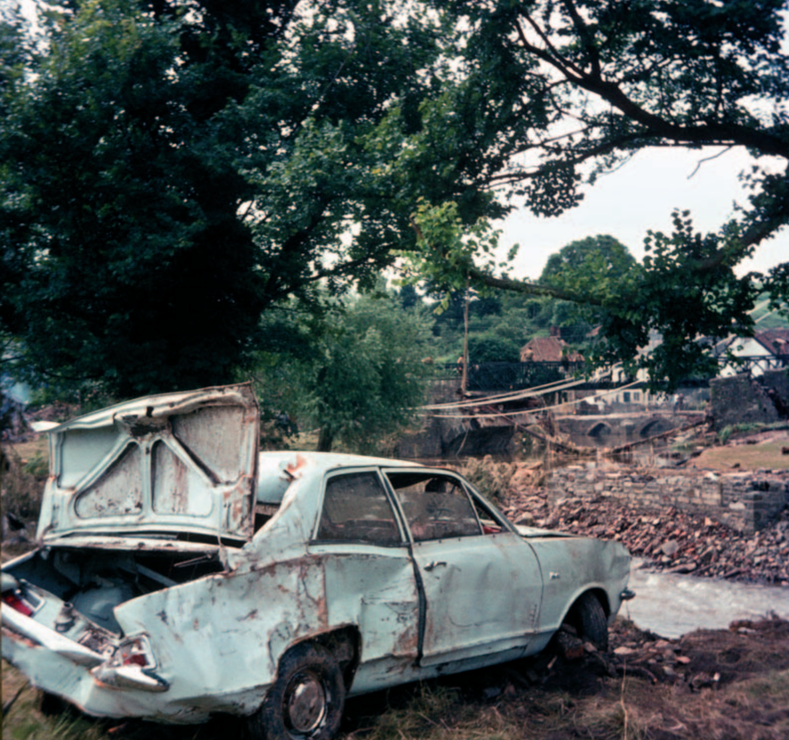
A car swept away at Pensford – in the background is the temporary Bailey bridge