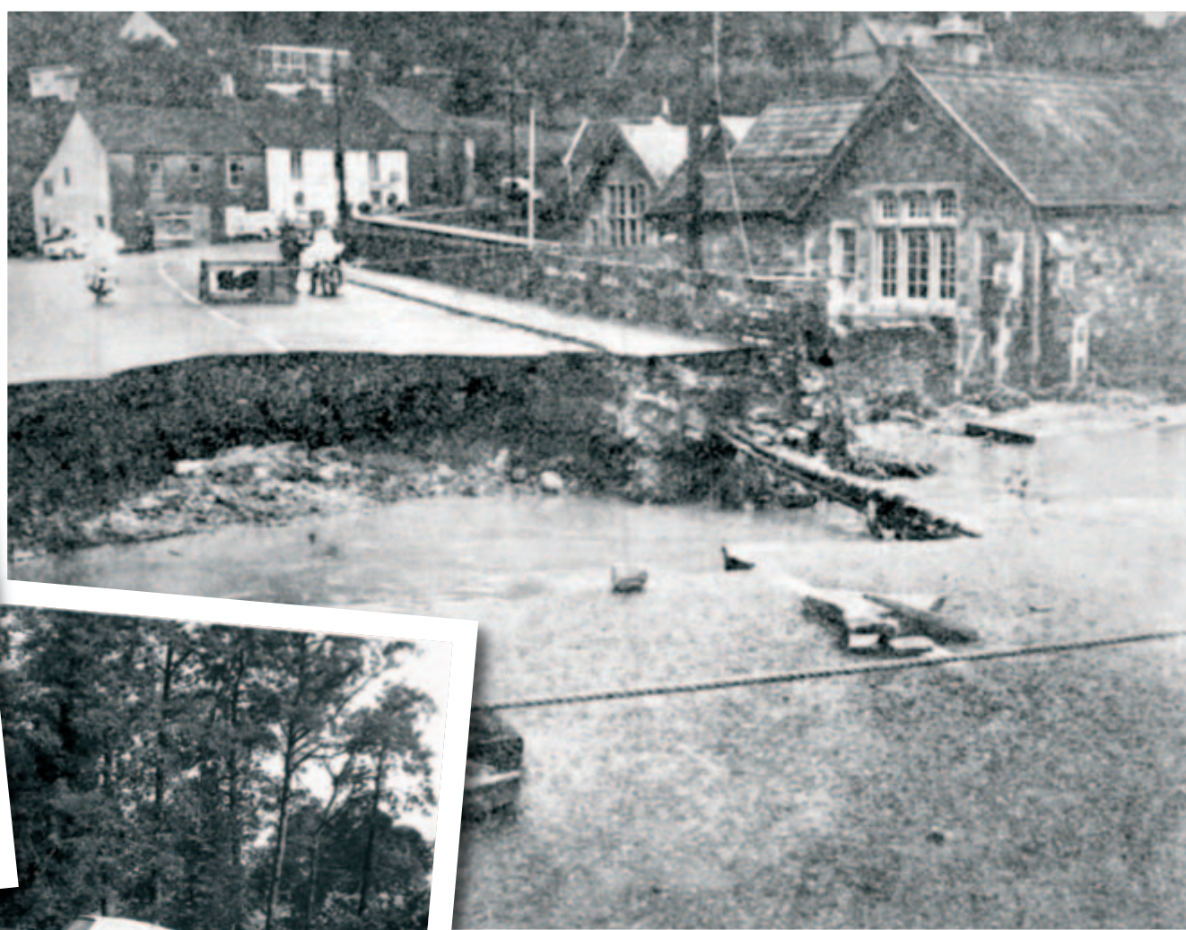
Swept away: The A37 bridge at Pensford

The normally staid annual report of Bristol Avon River Authority summed up events on the Chew: 'This river probably was the worst hit in the July flood and the amount of large trees which were brought down, shoals, damaged bridges and so on was almost unbelievable.'