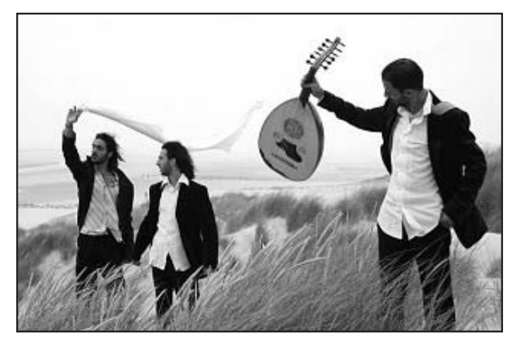
Le Trio Joubran Three ouds! Three brothers!! Saturday, February 23rd, 8 pm