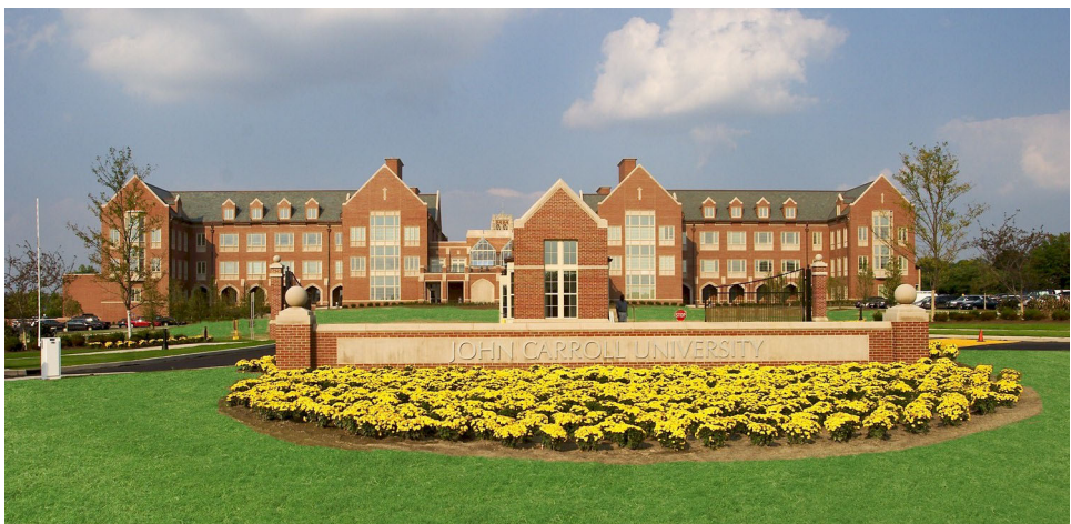
The Dolan Center for Science and Technology

The gymnasium is part of the the Student Center, which also houses the Ralph Vince Corbo Fitness Center.