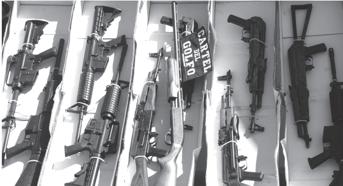
Weapons collected by Mexican authorities in a raid on members of the Gulf Cartel.

unusual punishment, and arbitrary arrests. 45 Even so, more Mexicans trust and support the use of the military than the police. For example, 83 percent of Mexicans support the use of the army to combat drug traffickers, 46 and more than 72 percent report trusting the armed forces, over 35 percent who say they trust the police. 47