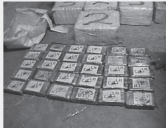
Stolen aircraft carrying drugs captured on a highway in Belize in April 2011 shown in Belize Police Department press release.