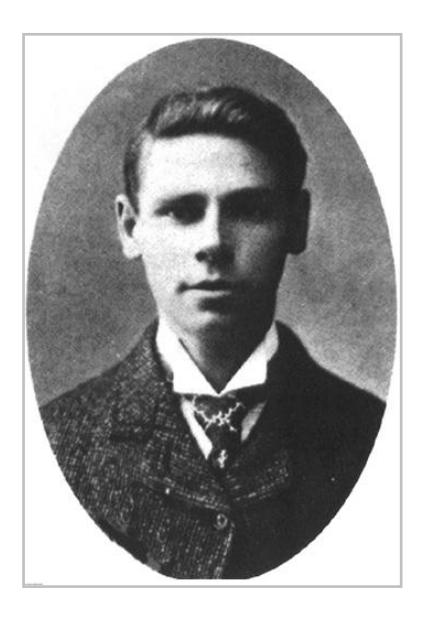
Horace Rawlins Won the first U.S. Open 1895 RU 1896 U.S. Open

Butchart and formed the Butchart-Nicholls golf company. They started shipping clubs in 1926. They made a line of clubs that had woods and irons fitted with laminated bamboo shafts. The two pros created the Swingrite Company to manufacture the shaft that Nicholls had had patented. The clubs were good but the timing was bad because steel shafts were legalized for tournament play in 1925. The clubs were still being sold in the 1930s.