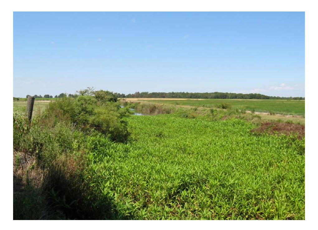
Figure 4. Typical Drainage Ditch in Piney Creek Basin. Note heavy emergent vegetation, water under vegetation is 4 to 6 feet deep.

The Piney Creek basin is a tributary to Big Creek, which in turn flows into the White River. Streams in the Mississippi Alluvial Plain that fall in the White River Basin are some of the most productive and species rich, low-gradient streams in the state. These streams have sand and silt substrates and abundant cover in the form of large woody debris. They characteristically have high total dissolved solids and moderate salinity. Habitat quality of streams in this area has been reduced in some places due to channel alteration and riparian deforestation. The White River Basin portion of the Mississippi Alluvial Plain is dominated by cropland (68%), while forest areas are much reduced (23%).