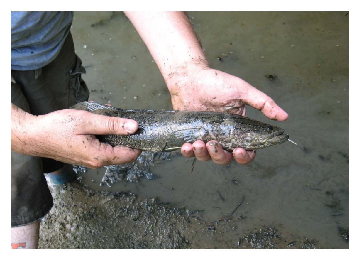
Figure 1. Northern Snakehead from the Piney Creek Basin.

Philadelphia County, Pennsylvania. One northern snakehead was collected in Burnham Harbor, Lake Michigan in 2004. In June 2005, northern snakeheads were discovered in Meadow Lake in Queens, New York and in May 2006, were reported in a pond in Kenilworth Aquatic Gardens in Washington D.C. (NSWG, 2007). Recently, the AGFC identified a northern snakehead found on a farmer's road in mid-April 2008, and later confirmed a breeding population in the Big Piney Creek drainage in Lee County, Arkansas. In late May 2008, New York Department of Environmental Conservation verified the presence of northern snakeheads in Catlin Creek, Orange County, New York.