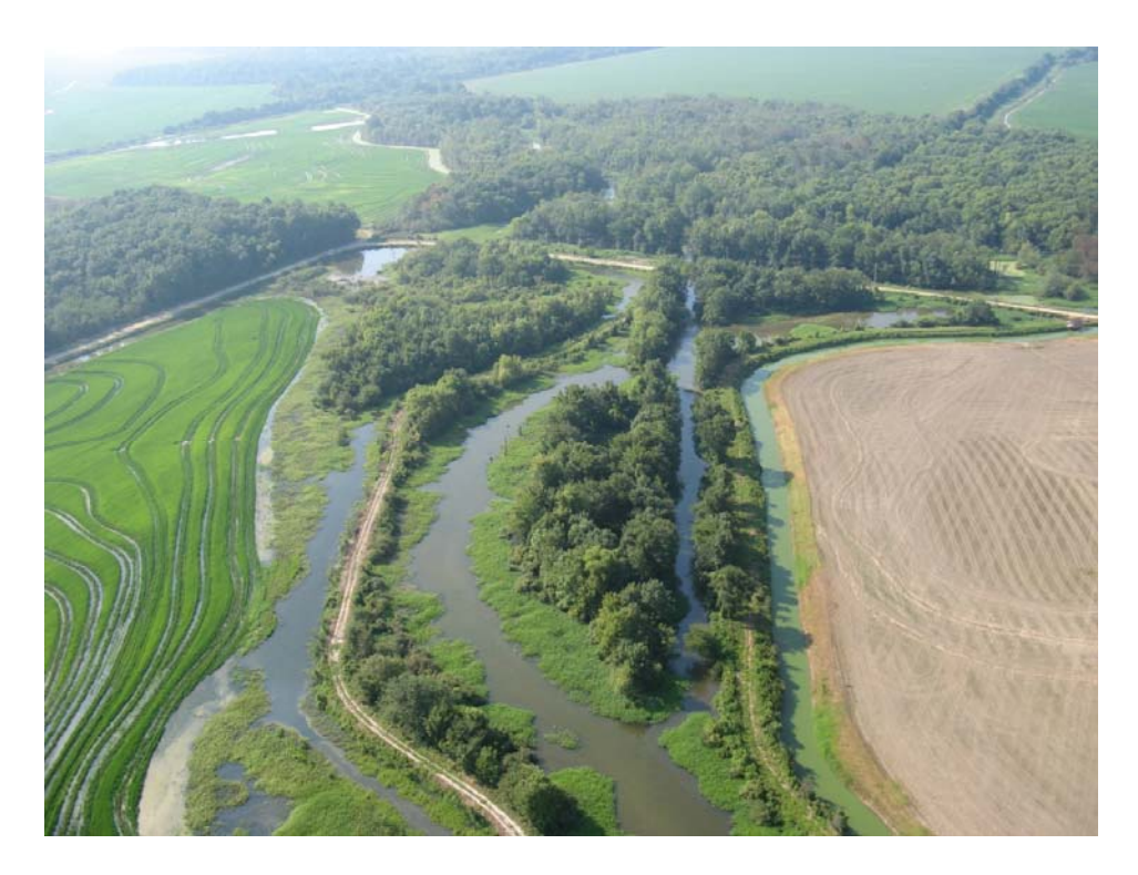
Figure 3. Typical Aerial view of Piney Creek Basin. Note the somewhat braided channel, wooded riparian zone, irrigation and drainage ditches, heavy emergent vegetation on edges of channels, and flooded rice fields.

Natural stream courses in this area meandered greatly, but have been highly altered and redirected to allow for a long history of agriculture. Current day crops are primarily rice, cotton, and soybeans, and aquaculture of bait fish, catfish, and crayfish is common. The area also provides significant waterfowl habitat, and water levels are managed in some places to enhance duck hunting opportunities. See Figures 3 and 4.