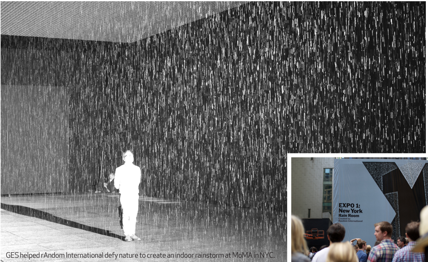
GES helped rAndom International defy nature to create an indoor rainstorm at MoMA in NYC.