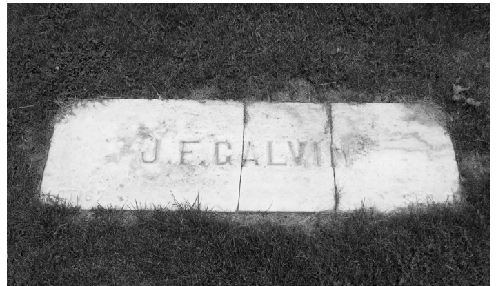
Pud Galvin's gravesite in Greenfield's Calvary Cemetery

“With a heart as big as himself, he never refused aid to anyone in need, he was everybody’s friend and in his death the community loses an athlete who helped lift baseball to its present unparalleled prominence, who was a diamond marvel in his day, a loyal comrade under any conditions, an affectionate and indulgent husband and father, and, in all that the world (sic) implies, a man.”