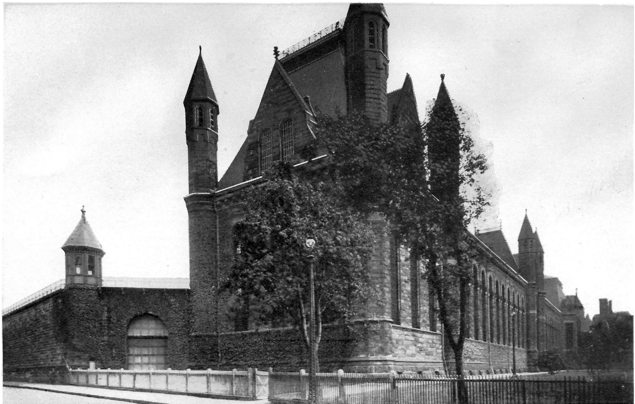
The Western Pennsylvania Penitentiary (shown c.1910) was one of the stops on the April 17th 'Architects in Allegheny' bus tour