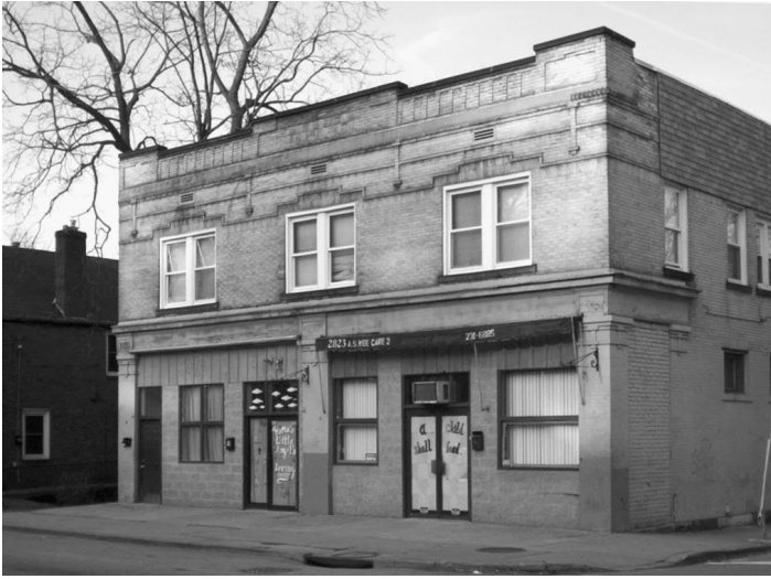
2823 Perrysville Avenue today

as production manager for Reymers. That was twice the salary received by the head of the company! Who would have guessed that our favorite refreshment was so profitable and that the drink itself is the only remaining evidence of what was once a name associated with all things sweet in Pittsburgh—Reymer’s!