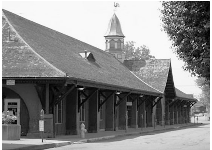
Wheeling Centre Market

Tour the renovated courtroom at the Independence Hall Museum where the Restored State of Virginia met and later the legislature of the new state of Western Virginia. See the first capital of the state and the Centre Market built in the 1850s where slaves were bought and sold.