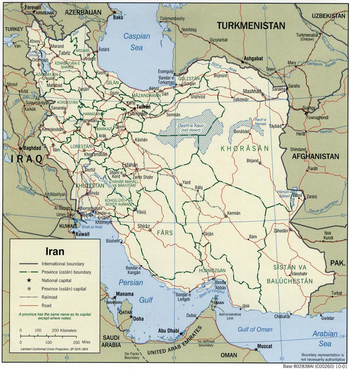
Map 1: Iran