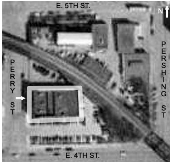
The arrow indicates the location of the Burtis Opera House.

Address _____ 415 Perry Street _____ City _____ Davenport _____