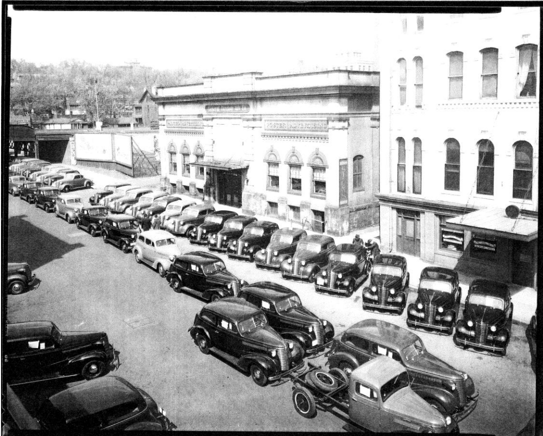
This 1938 image of the Burtis Opera House reveals that many of the changes to the historic façade had been made by this time. Notice the loss of the upper stories (particularly the mansard roof).