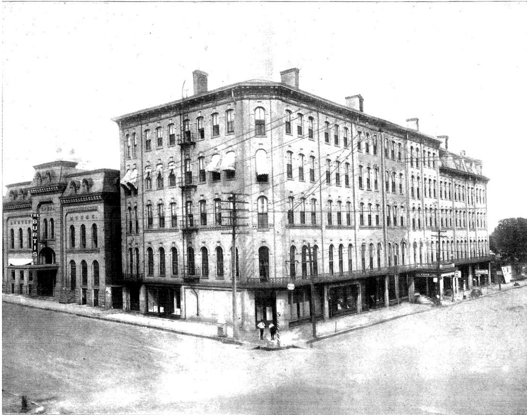
This undated historic image documents the Burtis Opera House along side its neighbor, the Kimball House, later known as the Vale Apartments. The Kimball is non-extant.