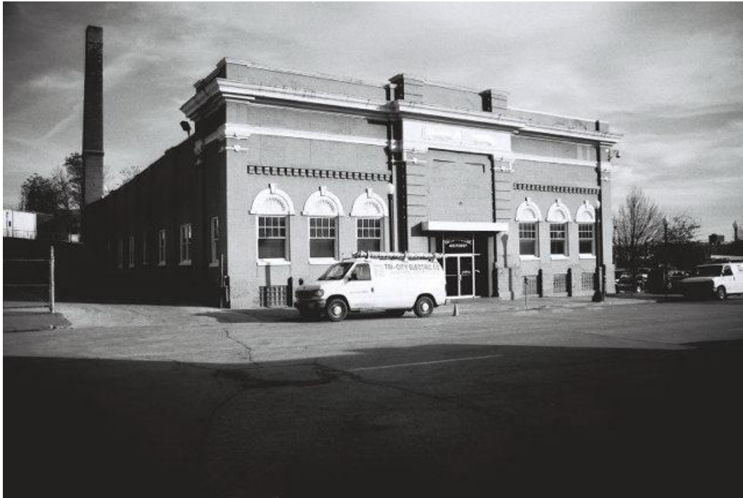
View of the primary (west) and north elevations, looking southeast from across Perry Street.

Address _____ 415 Perry Street _____ City _____ Davenport _____