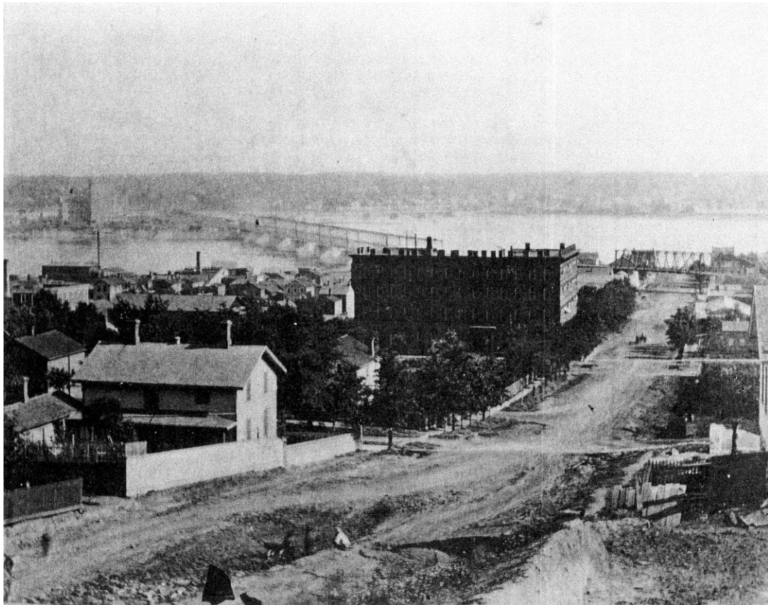
This amazing image from 1887 captures a view of Perry Street looking south from near 7th Street. The Burtis Opera House was sited beyond the large building seen in this view.

Address _____ 415 Perry Street _____ City _____ Davenport _____