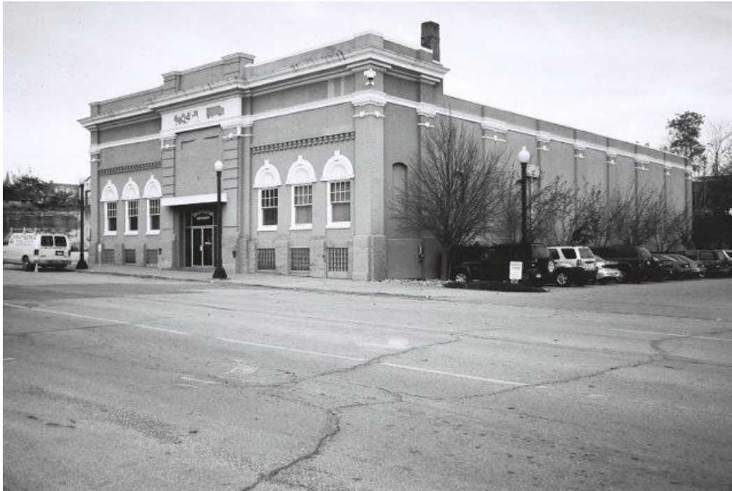
View of the primary (west) and south elevations, looking northeast from across Perry Street.

Address _____ 415 Perry Street _____ City _____ Davenport _____