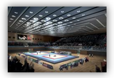
The Beijing Science and Technology University Gymnasium

Aikido, Sambo, Sumo & Wrestling Olympic venue for Wrestling