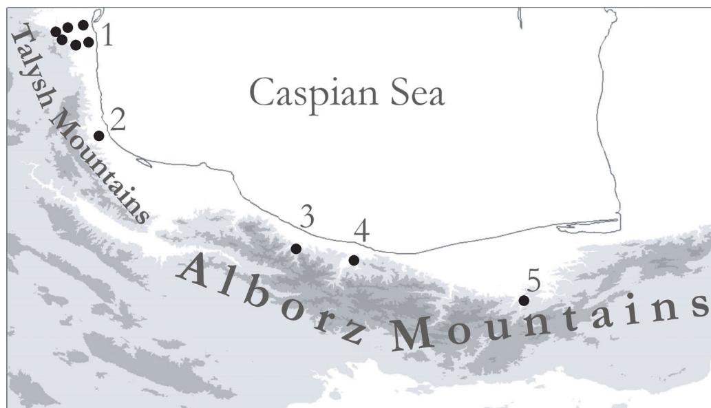
Fig. 2. Distribution of Microtus (Hyrcanicola) schelkovnikovi . 1 – Lenkorani Lowland and North Talysh Mountains, Azerbaijan (together about 20 localities); 2 – Assalem, near Hashtpar, South Talysh Mountains, Iran; 3 – Khorramabad, Pish Kuh, Alborz Mountains, Iran; 4 – Weyser, south of Nowshar, Alborz Mountains, Iran; 5 – Dasht Latch, near Pol-e-Sefid, Alborz Mountains, Iran.