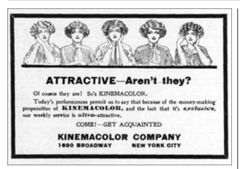
Fig. 1. Kinemacolor advertisement from Motion Picture News (1 March 1913): 25.

grammes were also featured in up to forty theatres within the central London region over the next two years. <sup>11</sup> A system of exclusive exhibition rights saw all Kinemacolor exhibitions in Great Britain and Ireland (outside a ten mile radius from Charing Cross) granted to Provincial Palaces Ltd., while all London exhibitions within that ten mile radius were controlled by Kinemacolor (London District) Ltd., a subsidiary set up by Urban for the purpose. However, within this agreement there was an additional exclusive contract covering any theatre within a two mile radius from Cambridge Circus, the location of the Palace Theatre, which continued to be the premier location for Kinemacolor presentations. <sup>12</sup>