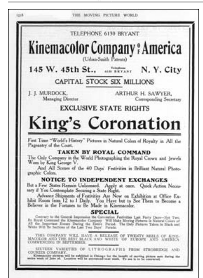
Fig. 3. Advertisement for the Kinemacolor film of the coronation of King George V. Moving Picture World (1911): 1518.

of exhibition at the Scala, was achieving the fundamental goals of the non-fiction film producers of Urban's time: to make the film experience the equivalent of experience itself, to bring the past back to life. 'The spectator gets from the picture exactly the same impressions that he would if he occupied the best possible seat at the actual ceremony', the catalogue stated.<sup>23</sup> Urban may have been appealing to the snobbery in his select Scala audience, but effectively he was granting to anyone in the country with the price for a Kinemacolor show the most privileged seat at the highest of ceremonies. The spectator could be at one with the princes, dukes and emperors. Such an act of leveling was never in Urban's mind, but in placing his cameras in positions of privilege he unwittingly played his early part in the progressive undermining of the royal mystique which