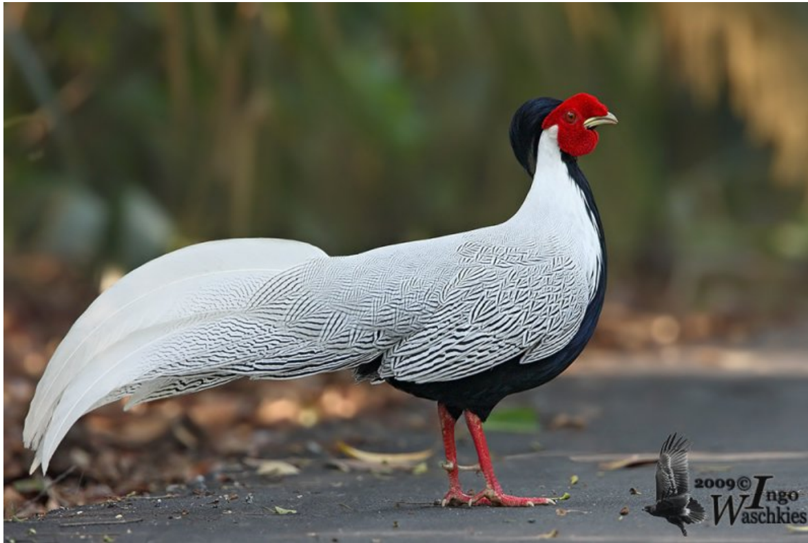
jēt 'Silver Pheasant'