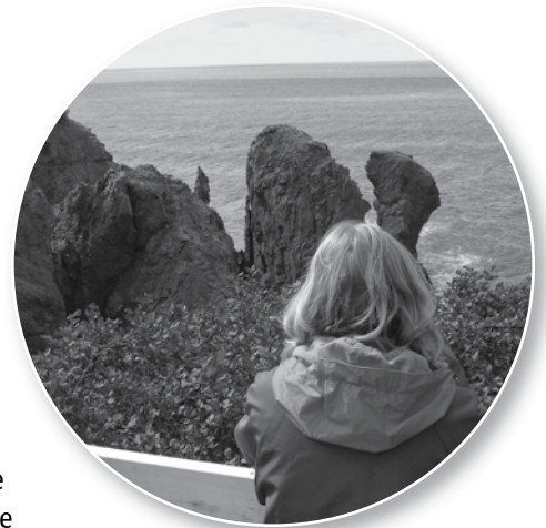
Viewing platforms offer vantage points for the Three Sisters formations.

Visitors can choose from two trails. One leads to the Three Sisters, magnificent sea-stacks, engulfed in local folklore. The second trail takes visitors to Squally Point, a raised beach created thousands of years ago when glaciers covered much of the area. Seven barrier-free viewing platforms offer spectacular vantage points as well as interpretive information. Rest and picnic areas are located along the trails. While it might seem like a long drive, the experience waiting at the top of the cliffs is well worth the adventure. • www.capechignecto.net