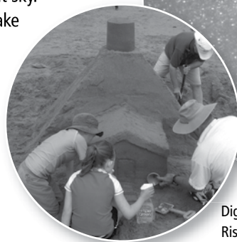
Dig into the Sand Castle Competition at Rissers Beach Provincial Park.

Marvel at the Milky Way during the Sky-watch event at Ellenwood Lake Provincial Park.