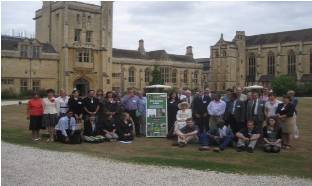
Photo: a lively session at our conference last year at Mansfield College, Oxford University