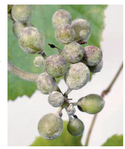
Wine woes. Powdery mildew (above) and other fungal diseases can devastate vineyards.

Although only about 5% of Europe's farmland is dedicated to wine vineyards, they account for about 70% of the region's fungicide use.