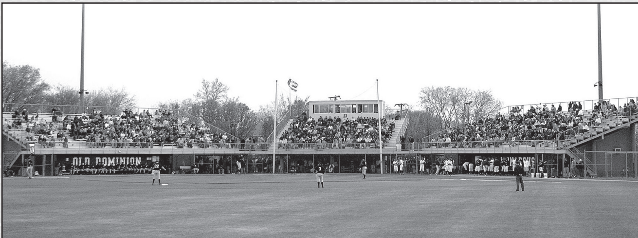
Bud Metheny Baseball Complex