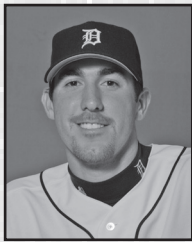
Justin Verlander Manakin-Sabot, VA

2006 AMERICAN LEAGUE ROOKIE OF THE YEAR 2011 AMERICAN CY YOUNG AWARD WINNER 2011 AMERICAN LEAGUE MVP