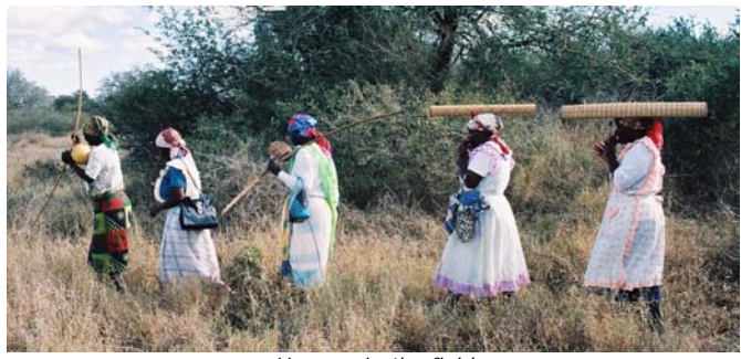
Harpers in the field

making 100,000 instruments a week, were struggling to keep up with demand.<sup>1</sup>