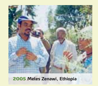
Previous Yara Prize laureates

The Yara Prize shall provide inspirational example(s) of African leadership