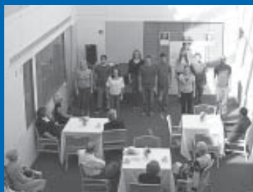
Streets of America in the Atrium

Students in the Department of Performing Arts take to the "stage" in the Battelle-Tompkins Atrium to entertain attendees of the Dean's Emeriti Tea with their rendition of Streets of America , a new musical which was previously presented at the Kennedy Center's Page to Stage festival (see page 3). Faculty emeriti in attendance at the September 12 tea were also treated to a cello and dance performance by DPA students.