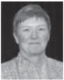
Tam Flarup Web Site Services