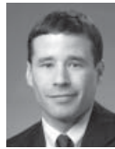
Rob Porteus Video Services