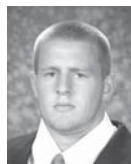
99 J.J. Watt