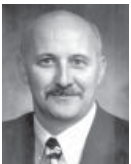
Terry Schlatter Equipment