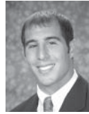
21 Chris Maragos