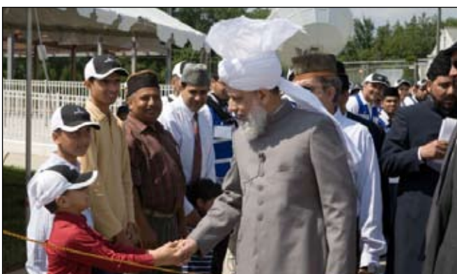
Mirza Masroor Ahmad - 5th Caliph