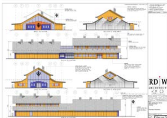
Plans for the new community centre in Ifield