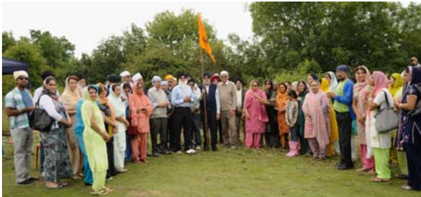
Nishan Sahib hosting ceremony at our Overdene Drive site, with a prayer to our wahe guru ji for guidance and blessing (August 15 2010)