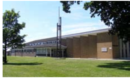
The Chapel on Old Horsham Road

Old Horsham Road Southgate Crawley RH11 8PD Tel: 01293 520639