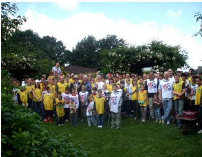
Church members at the Interfaith Garden in West Green Park as part of a Let's FACE it! project

For further information visit www.lds.org.uk or www.mormon.org