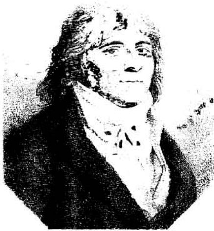
Figure 3. Portrait of François Levaillant, friend of Bécoeur, who included the secret of the arsenical soap in a sale to the French government in 1797 (Bechstein, 1797: I: frontispiece).

Evidence has now been found that it was François Levaillant (1753–1828), who kept the secret of the arsenical soap and passed it on to the authorities in France (Figure 3). Levaillant was acquainted with Bécoeur in Metz from 1763, moved to Paris in 1779, explored the interior of South Africa from 1780 to 1784 and returned to pursue his ornithological studies in Paris and Lunéville (Rookmaaker, 1989; Rookmaaker et alii , 2004). In the wake of the French revolution, Levaillant actively tried to sell his collection, comprising birds, insects and the skin of a giraffe, to the French government. In the process, his applications and the ensuing reports were discussed in a number of meetings by the relevant governmental committees.